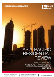
Asia-Pacific Residential Review 2017