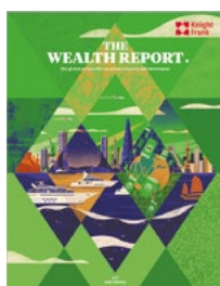
The Wealth Report 2017