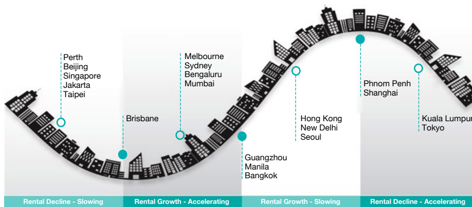
FIGURE 3 Prime Office Rental Cycle

^ Based on net floor areas for except for China, India, Korea, Taiwan, Thailand (gross) and Indonesia (semi-gross) ** Inclusive of incentive, service charges and taxes. Based on net floor areas.