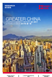
Greater China Property Market Report Q1 2017