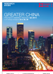
Greater China Property Market Report Q3 2014