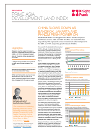
Prime Asia Dev. Land Index H1 2014

Knight Frank Research Reports are available at KnightFrank.com/Research