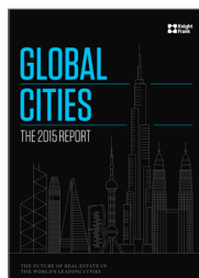
Global Cities The 2015 Report