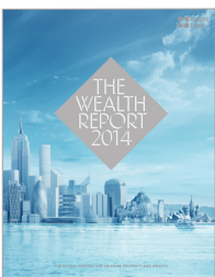
The Wealth Report 2014