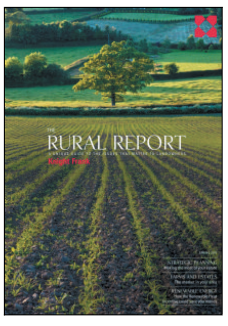
View The Rural Report Spring 2011 PDF here