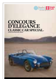
Luxury Investment Index Q2 2016

Knight Frank Research Reports are available at KnightFrank.com/Research