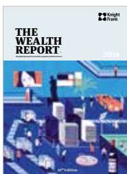
The Wealth Report 2016