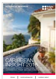
Caribbean Insight 2016