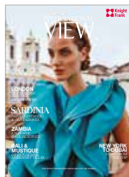
International View 2016

The Research data provided in this report was originally published within France: Inside View