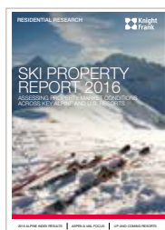
Ski Property Report 2016