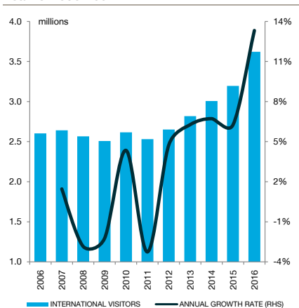
FIGURE 1 Sydney International Visitors Year to December

At present, there are 835 hotel rooms across five hotels in Sydney Olympic Park, underpinned by the Pullman (218 rooms) and Novotel (177 rooms) hotels. Notably, existing room supply is skewed towards 4.5+ star accommodation, representing 64% of rooms. No new hotels have been added to the market since 2012 (Quest Apartments). Looking ahead, there are no additional rooms in the short to medium term pipeline, however there is potential for additional supply to be added through the release of new sites. We note, beyond the Sydney Olympic Park precinct, there are