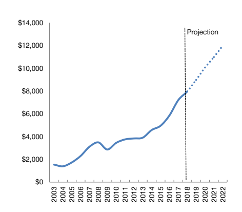
FIGURE 1 Melbourne CBD Strata Office Values Average Rate per m<sup>2</sup>

Favourable conditions in both the capital and leasing markets are driving strata office prices in the Melbourne CBD to record levels. The average strata sale rate (excluding car parking) currently measures $8,359/m² with the upper end of the market ranging from $10,000 to $11,500/m². This represents an increase of approximately 21% over the 12 months to July 2017. Knight Frank Research projects the strong capital value growth is likely to be sustained over the next four years due to a number of favourable drivers (figure 1).