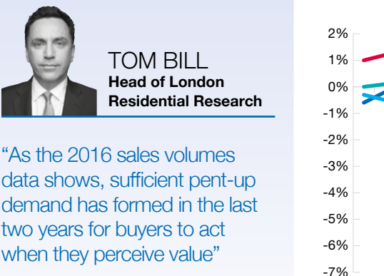
FIGURE 1 Price growth in prime central London

However, as the 2016 sales volumes data shows, sufficient pent-up demand has formed for buyers to act when they perceive value. Average values fell -6.3% in the year to December 2016, and we expect to see broadly flat price growth in 2017 as declines start to bottom out.