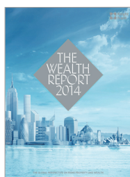
The Wealth Report 2014