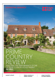
Prime Country Review Q4 2013