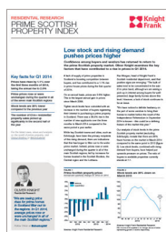
Prime Scottish Property Index Q1 2014