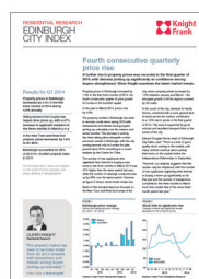
Edinburgh Index Q1 2014

Knight Frank Research Reports are available at KnightFrank.com/Research