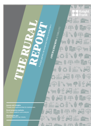
The Rural Report Autumn 2015