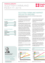
Scottish Farmland Index H1 2015