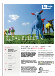
UK Rural Bulletin Spring 2015