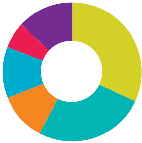
Figure 1 What do our applicants want to spend? New applicants, past 12 months