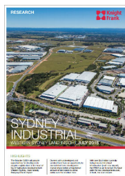
Western Sydney Land Insight July 2015