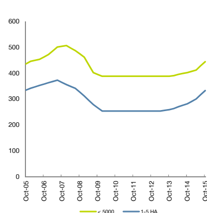
FIGURE 2 Sydney Industrial Land Values* Avg. Value Serviced Lots ($/m 2 )

* Avg Outer West, Inner Central West and South West