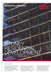
Sydney Residential Development H2 2015

Knight Frank Research Reports are available at KnightFrank.com.au/Research