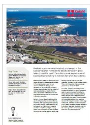
Sydney Industrial Vacancy Analysis October 2015