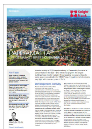
Parramatta Office Market Brief November 2015