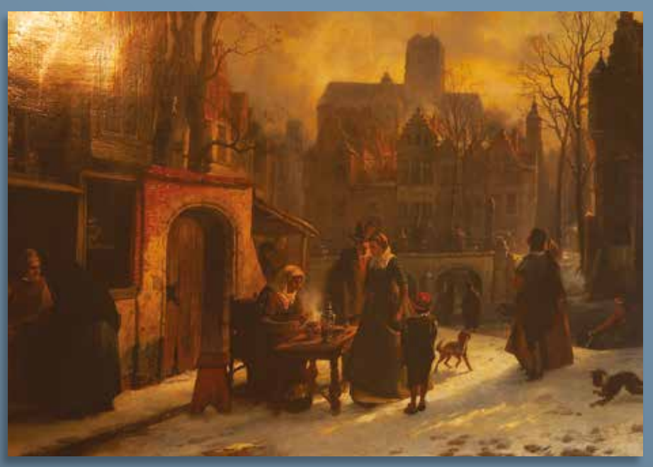
LOAN AGAINST AN ART COLLECTION

+44 1372 434138 KnightFrankFinance.co.uk