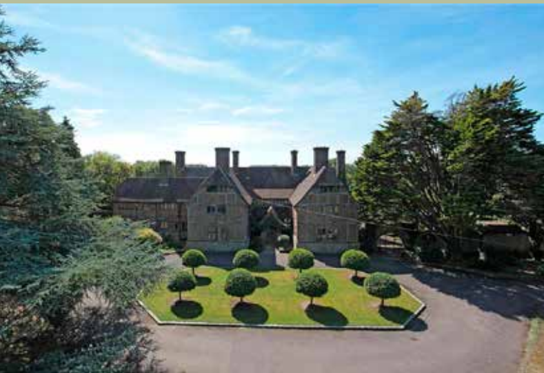
7. WARNHAM WEST SUSSEX