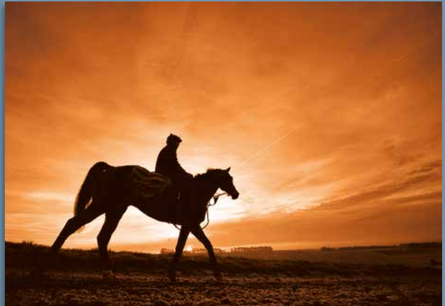
LOAN AGAINST A RACE HORSE

broker, our expert knowledge has helped our assets, not simply property.