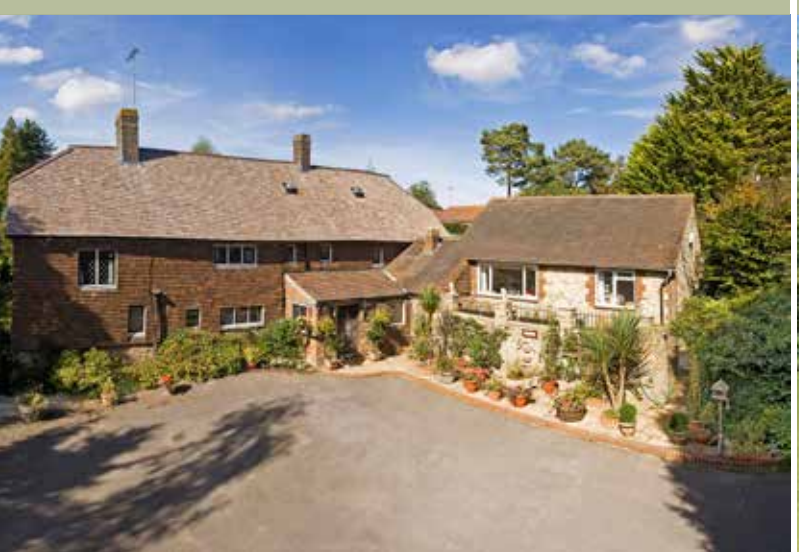
5. HICKSTEAD WEST SUSSEX