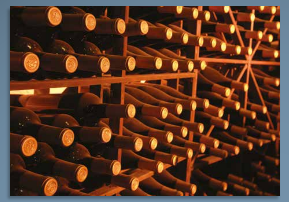
LOAN AGAINST FINE WINE