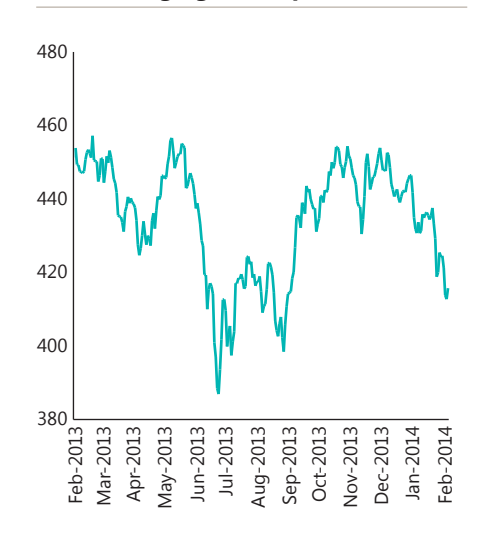
FIGURE 1 MSCI emerging Asia equities index