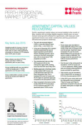
Perth Residential Market Update December 2015

Knight Frank Research Reports are available at KnightFrank.com.au/Research