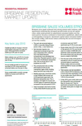
Brisbane Residential Market Update December 2015