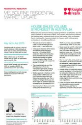
Melbourne Residential Update December 2015