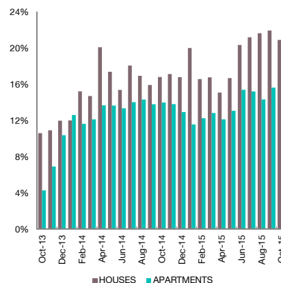
FIGURE 1 Greater Sydney Capital Growth 12-month rolling