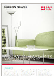
Australian Residential Market Apartments Overview Q4 2015