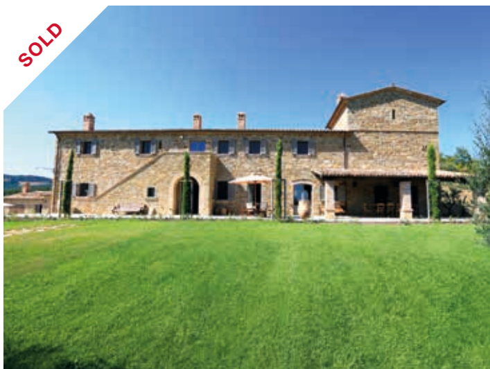
MERCATALE DI CORTONA GUIDE PRICE €2,875,000