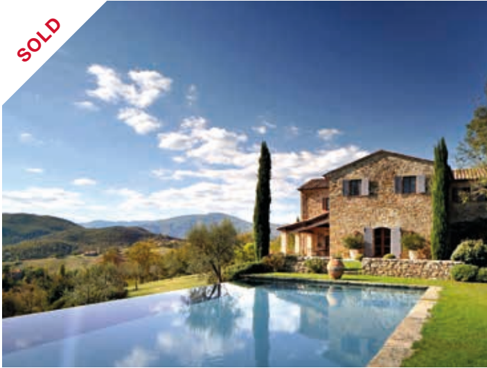
CASTELLO DI RESCHIO, UMBRIA