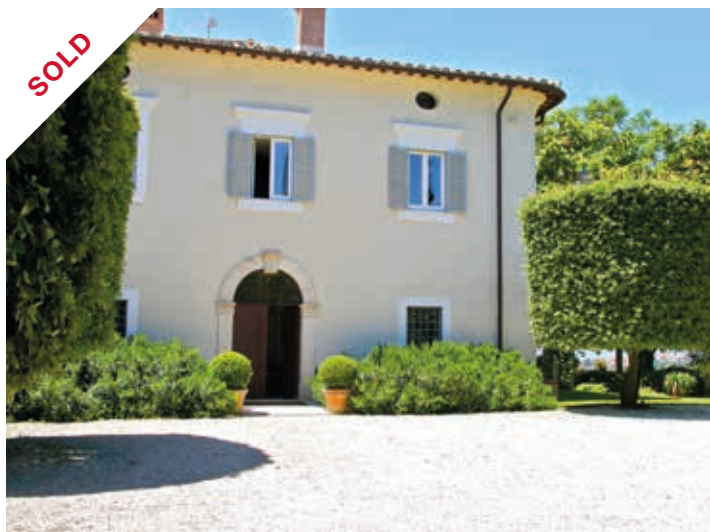
SABINA, LAZIO GUIDE PRICE €3,980,000