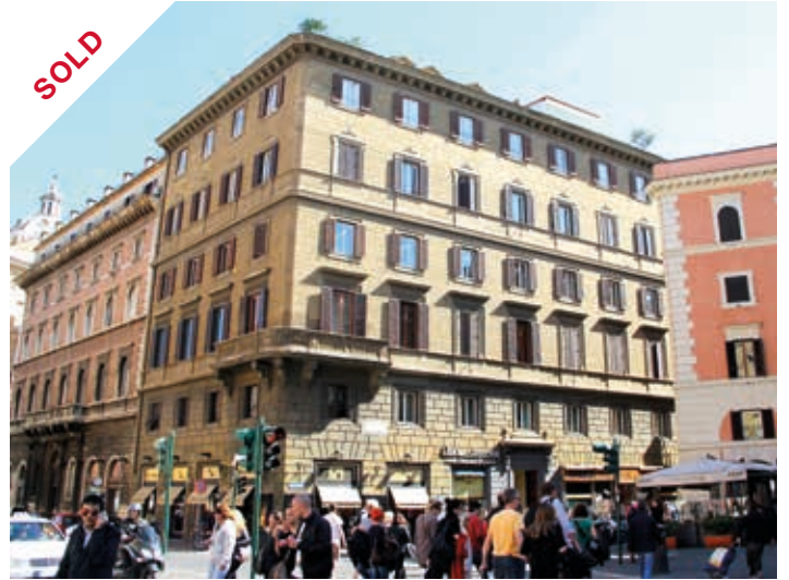
HISTORICAL CENTRE, ROME