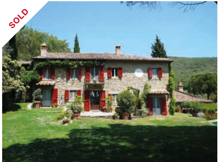
PERGO, TUSCANY GUIDE PRICE €2,950,000