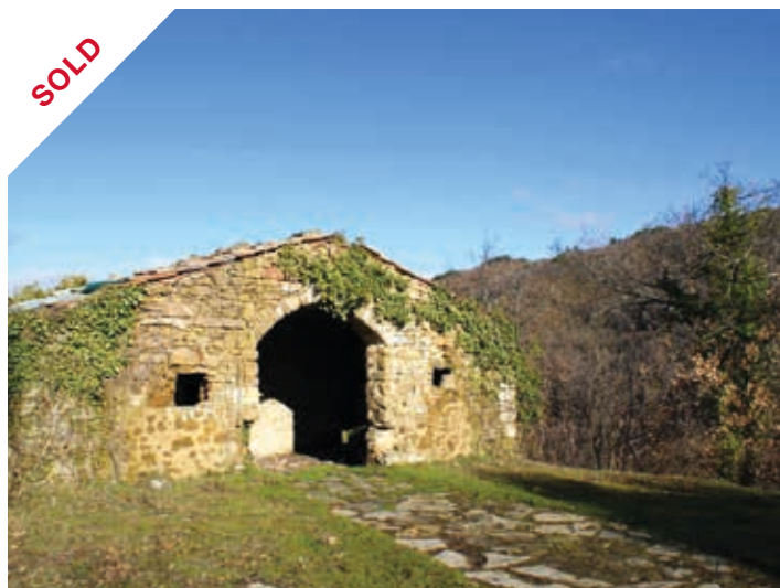
RADDA IN CHIANTI, TUSCANY GUIDE PRICE €1,500,000