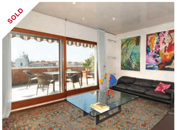
DORSODURO AREA, VENICE GUIDE PRICE €4,350,000