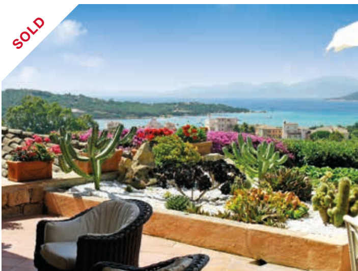
COSTA SMERALDA, SARDINIA