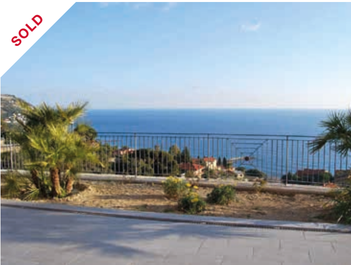
OSPEDALETTI, LIGURIA GUIDE PRICE €2,200,000