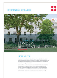
The London Review Autumn 2011