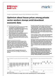
Knight Frank/Markit's HPSI Dec 2011