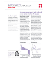
Prime Global Rental Index Q3 2011

Knight Frank Research Reports are available at www.KnightFrank.com/Research