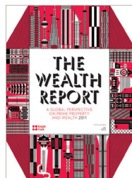
The Wealth Report 2011