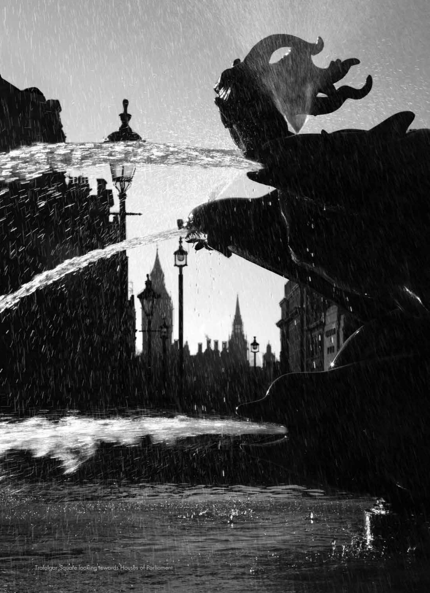
Trafalgar Square looking towards Houses of Parliament