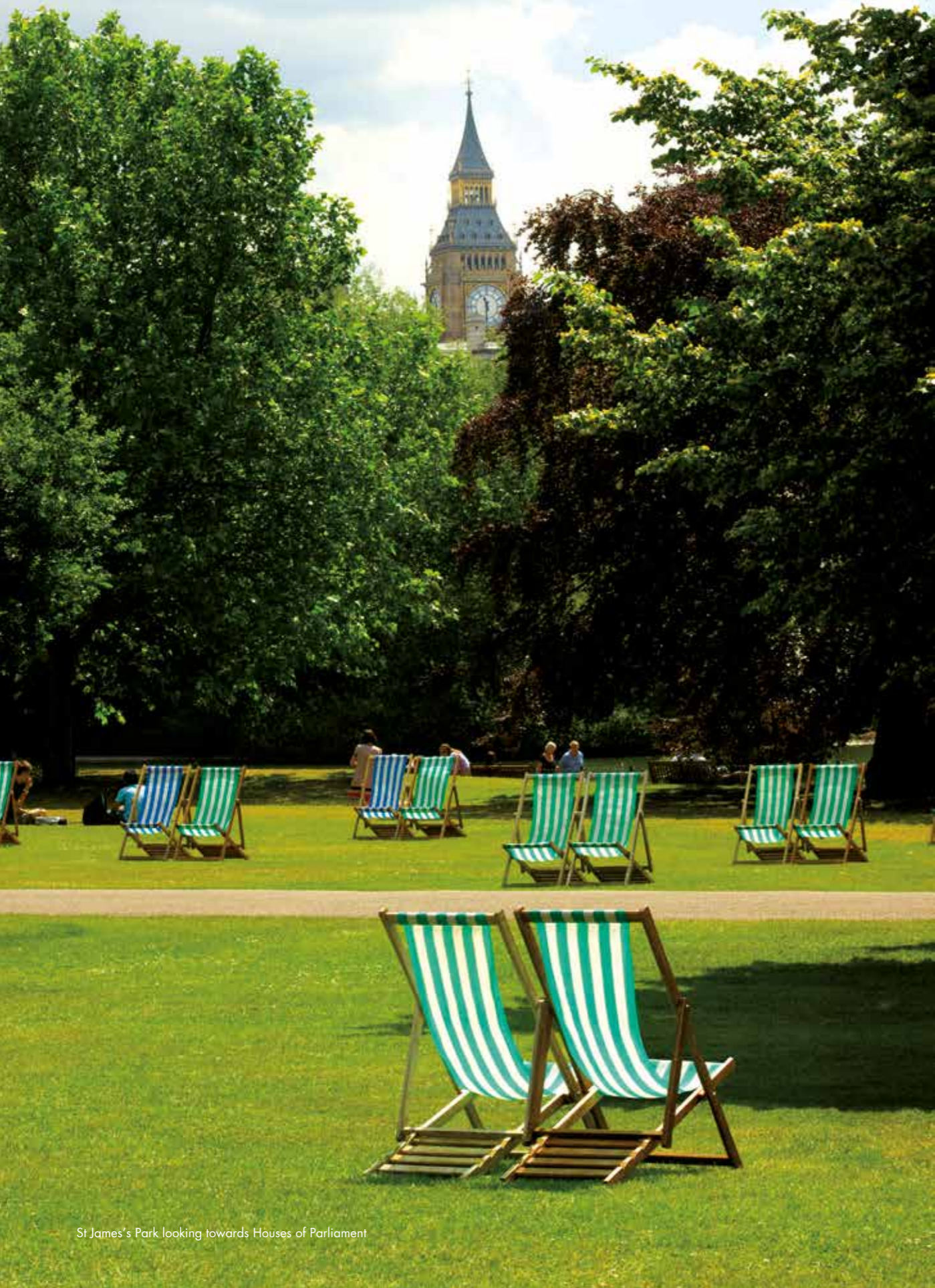
St James's Park looking towards Houses of Parliament