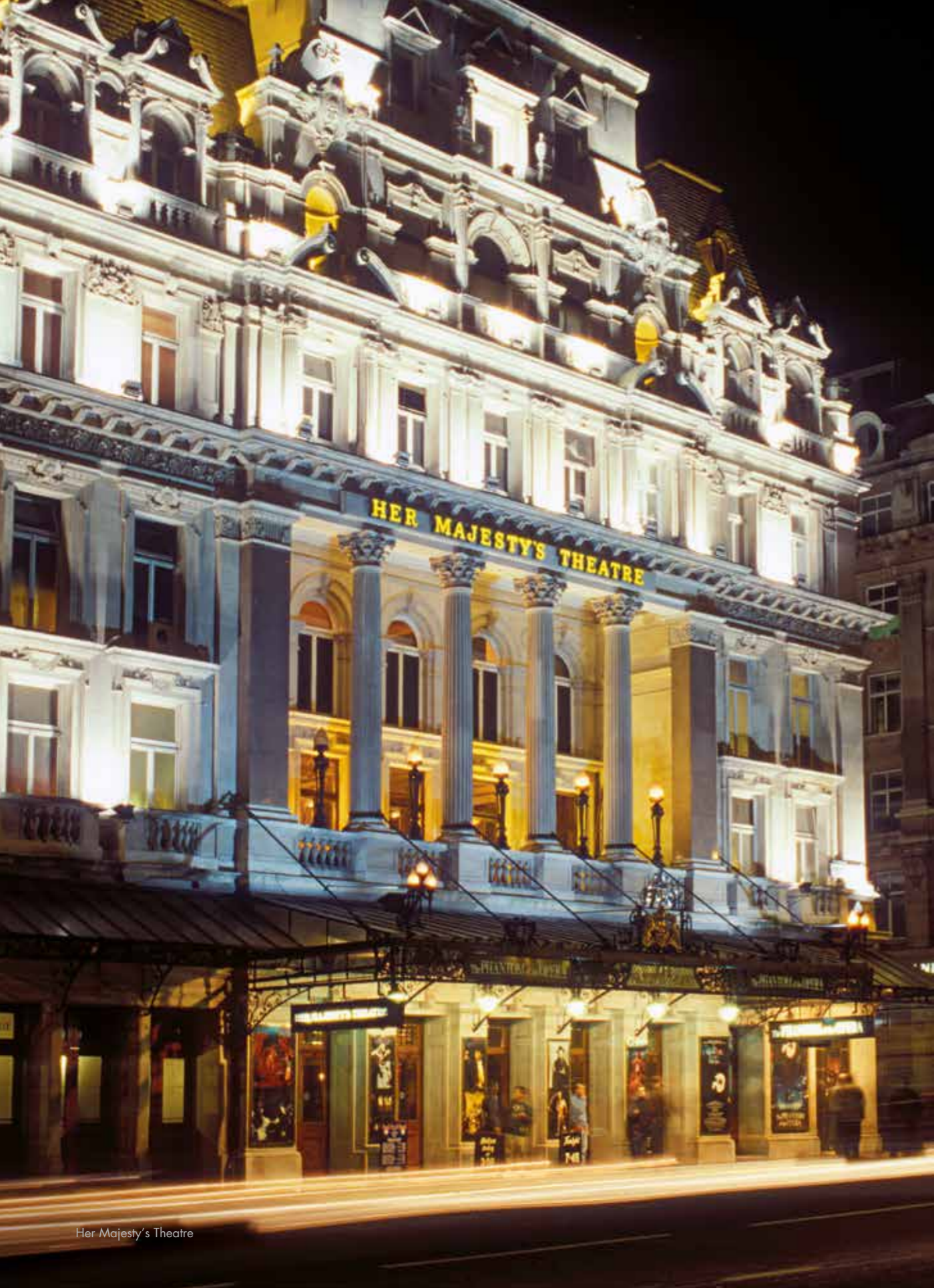
Her Majesty's Theatre