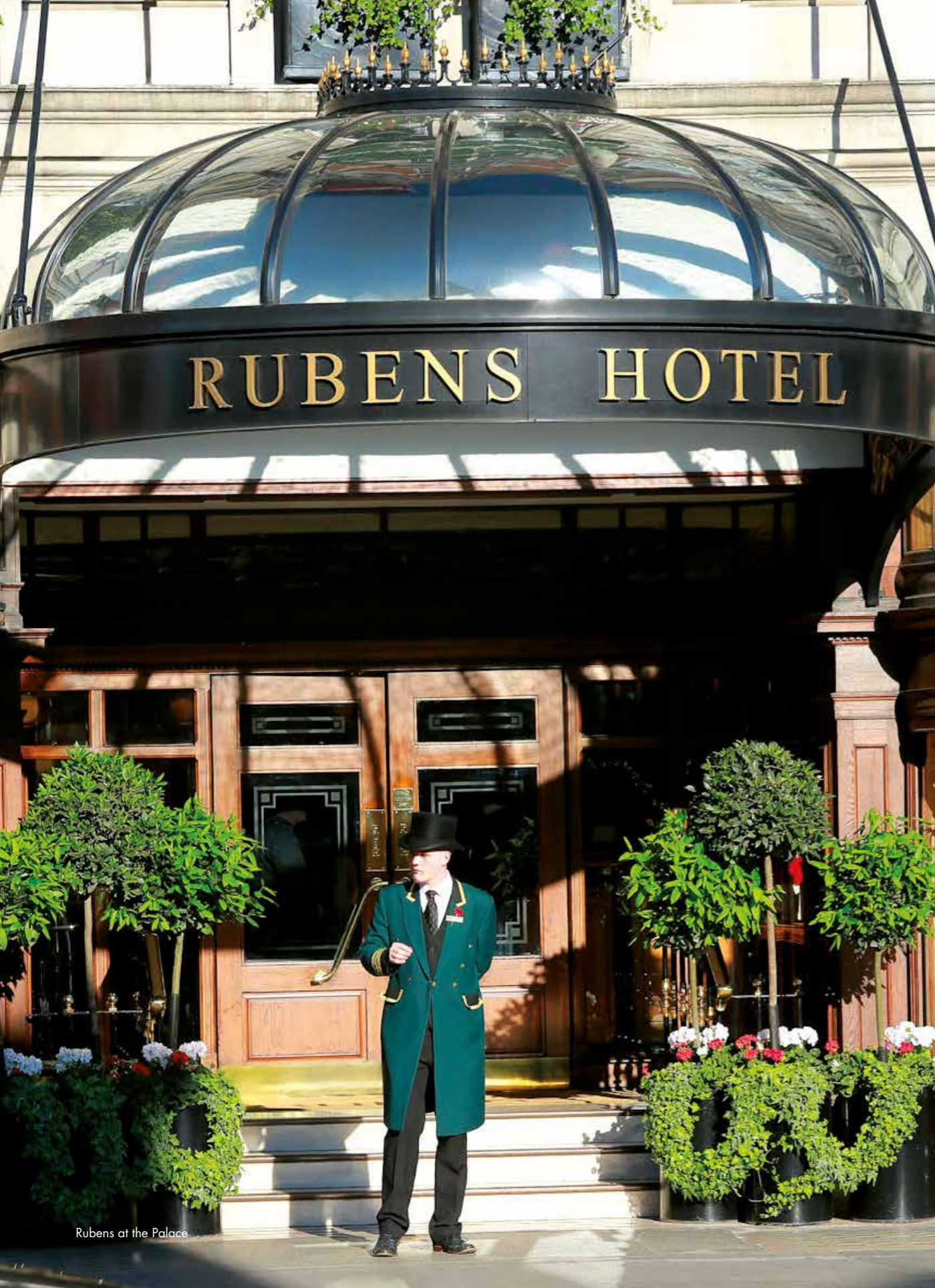
Rubens at the Palace