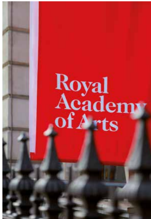
British Museum, Tate Britain, National Gallery and Royal Academy of Arts.