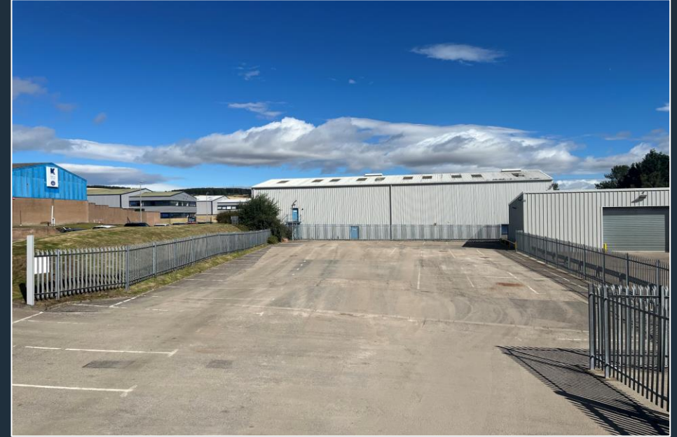
10,796 sqft of secure yard