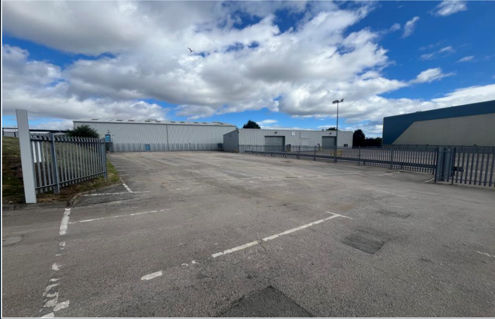
*The landlord will install a new gate and palisade fence ahead of occupation