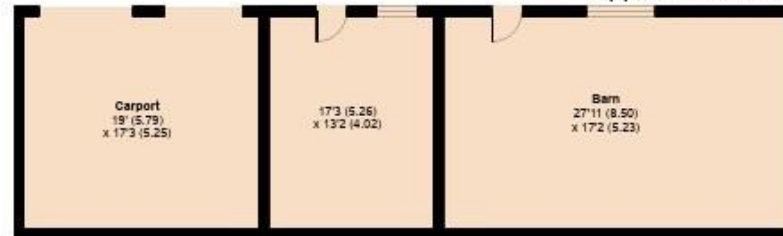
CARPORT / OUTBUILDING 1 / 2