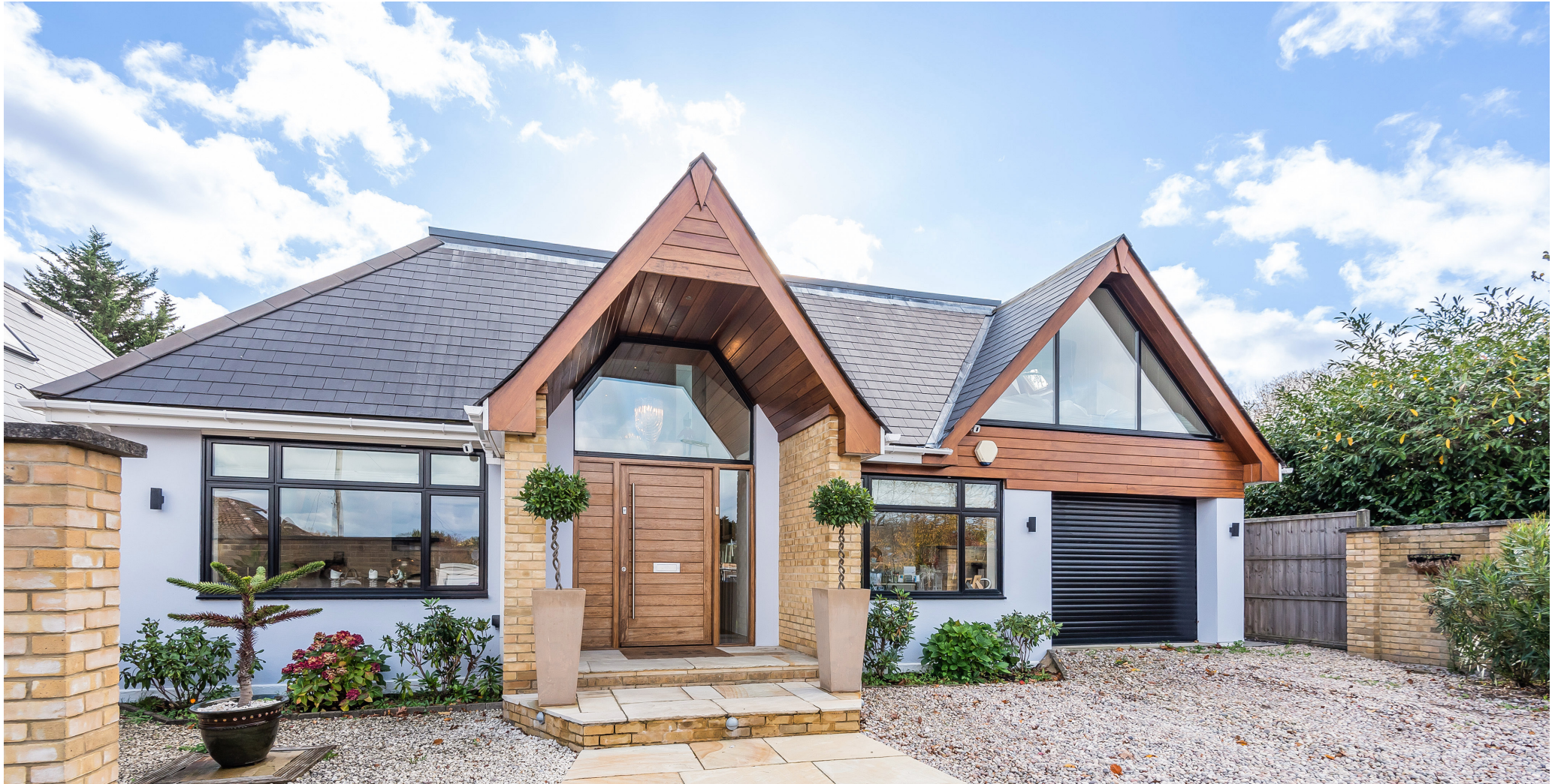
TRUMPSGREEN AVENUE, Virginia Water GU25