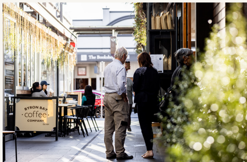
↖ Bowral Golf Club ← High Street shopping precinct