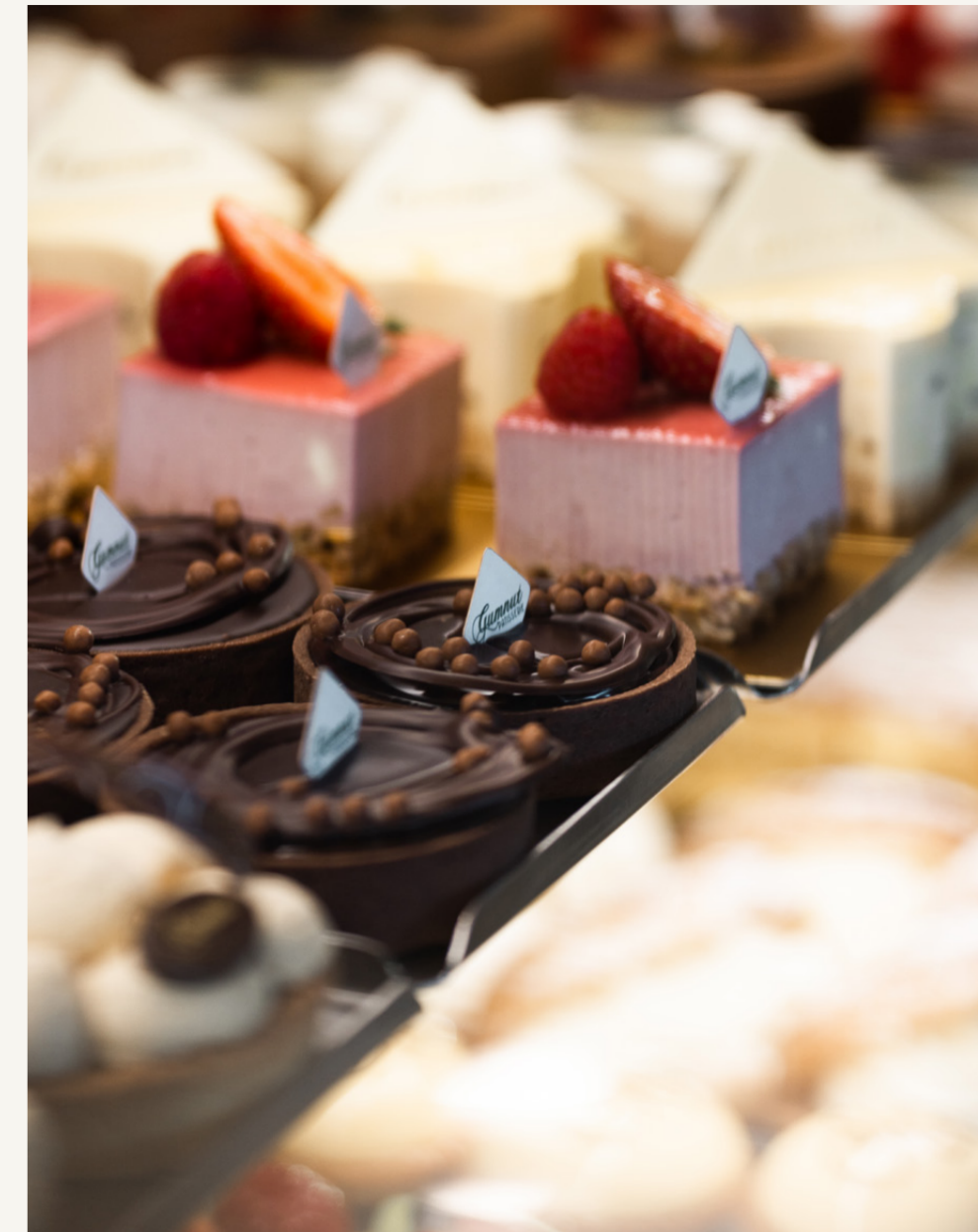
↑ Gumnut Patisserie Bowral ← Plantation Cafe