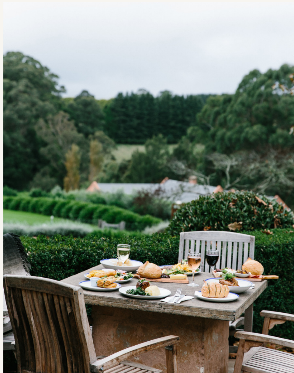
← Burrawang Village Hotel → The Press Shop

Press pause on the day's activities. Seek sustenance from another welcoming café. In Bowral, you're spoilt for choice.