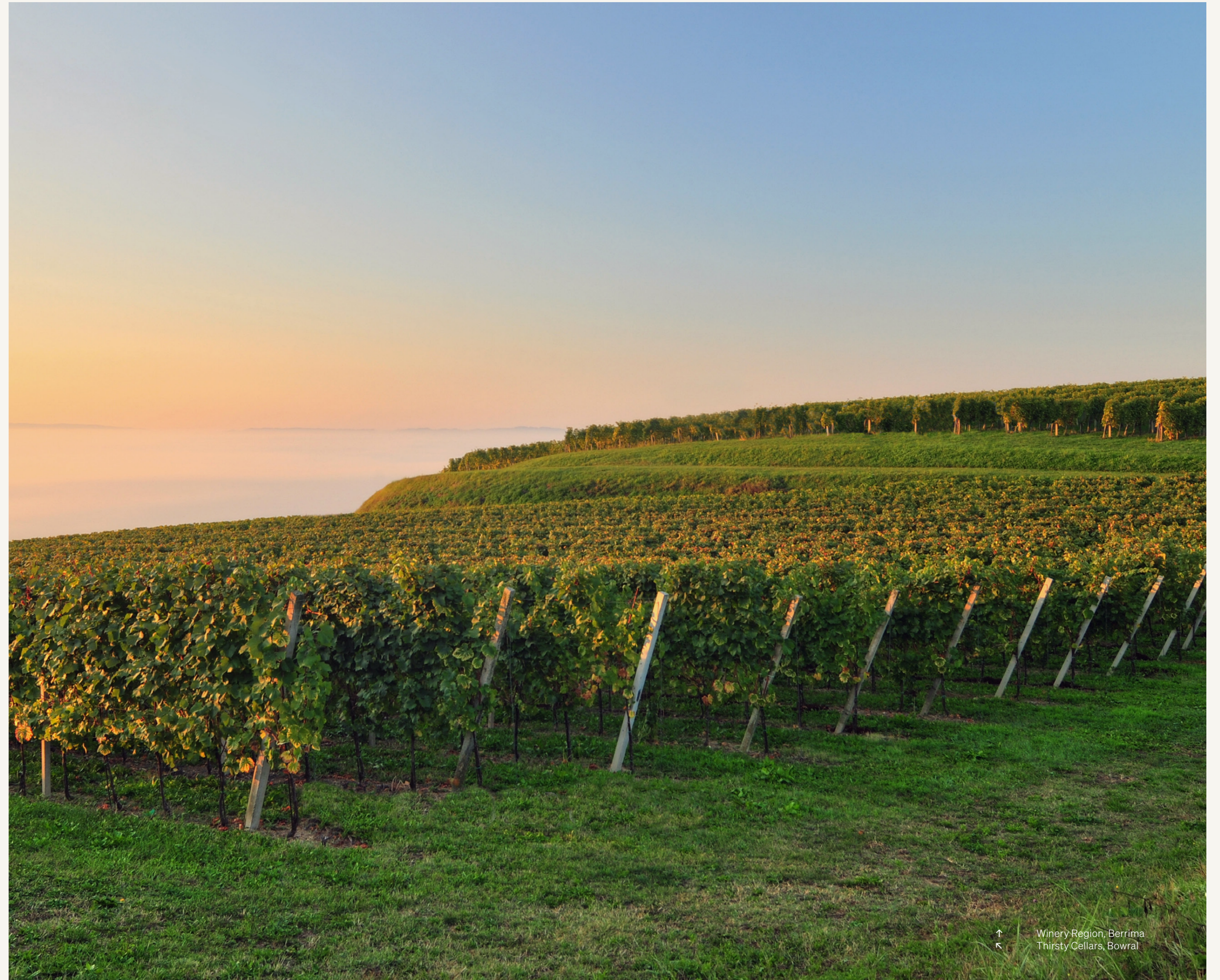
↑ Winery Region, Berrima ← Thirsty Cellars, Bowral

The Southern Highlands is famous for its pinot, and home to over 60 vineyards—ranging from charming cellar doors to modern masterpieces, as well as a slew of sustainable wineries leaving less of a trace.