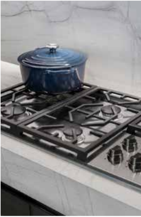
NATURAL STONE BENCH TOPS AND BACKSPLASH