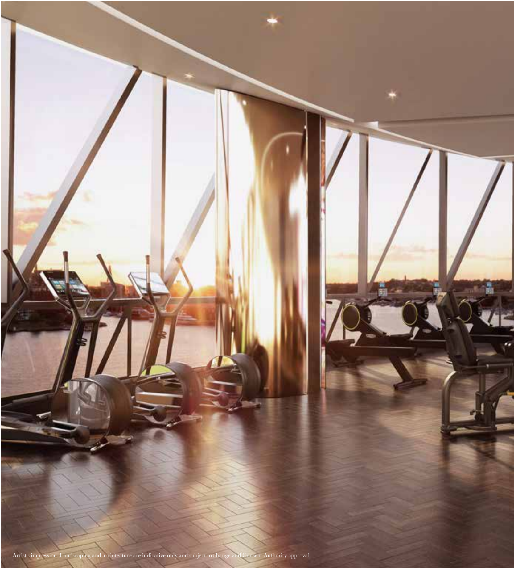
Artist's impression. Landscaping and architecture are indicative only and subject to change and Consent Authority approval.