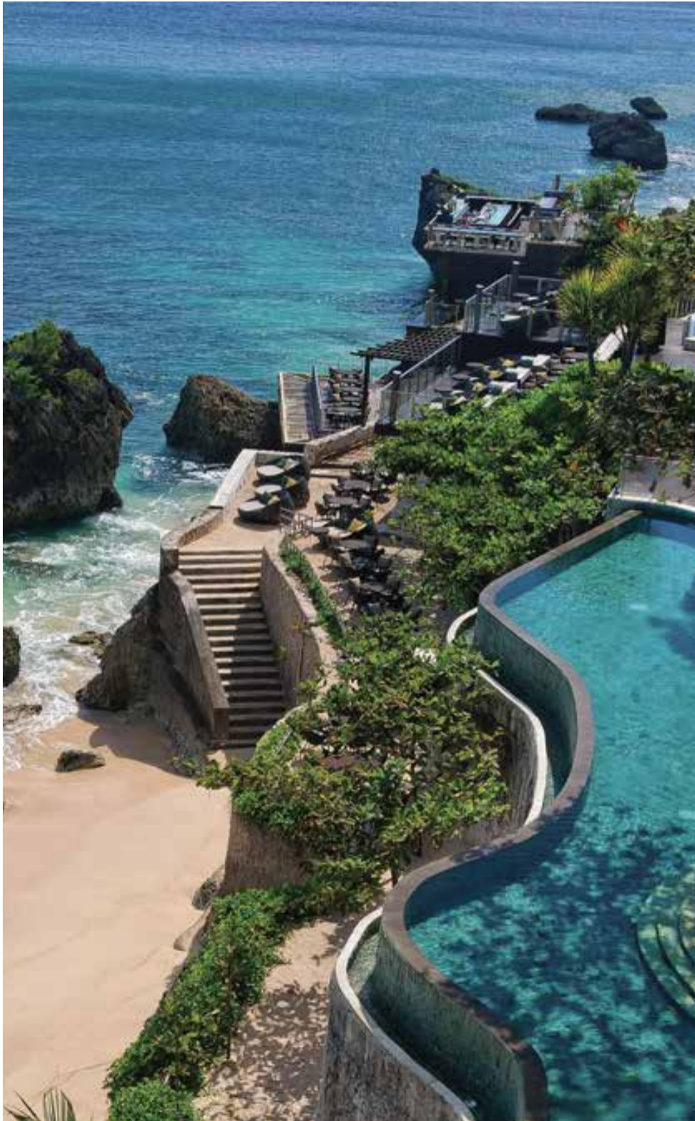
AYANA RESORT & SPA