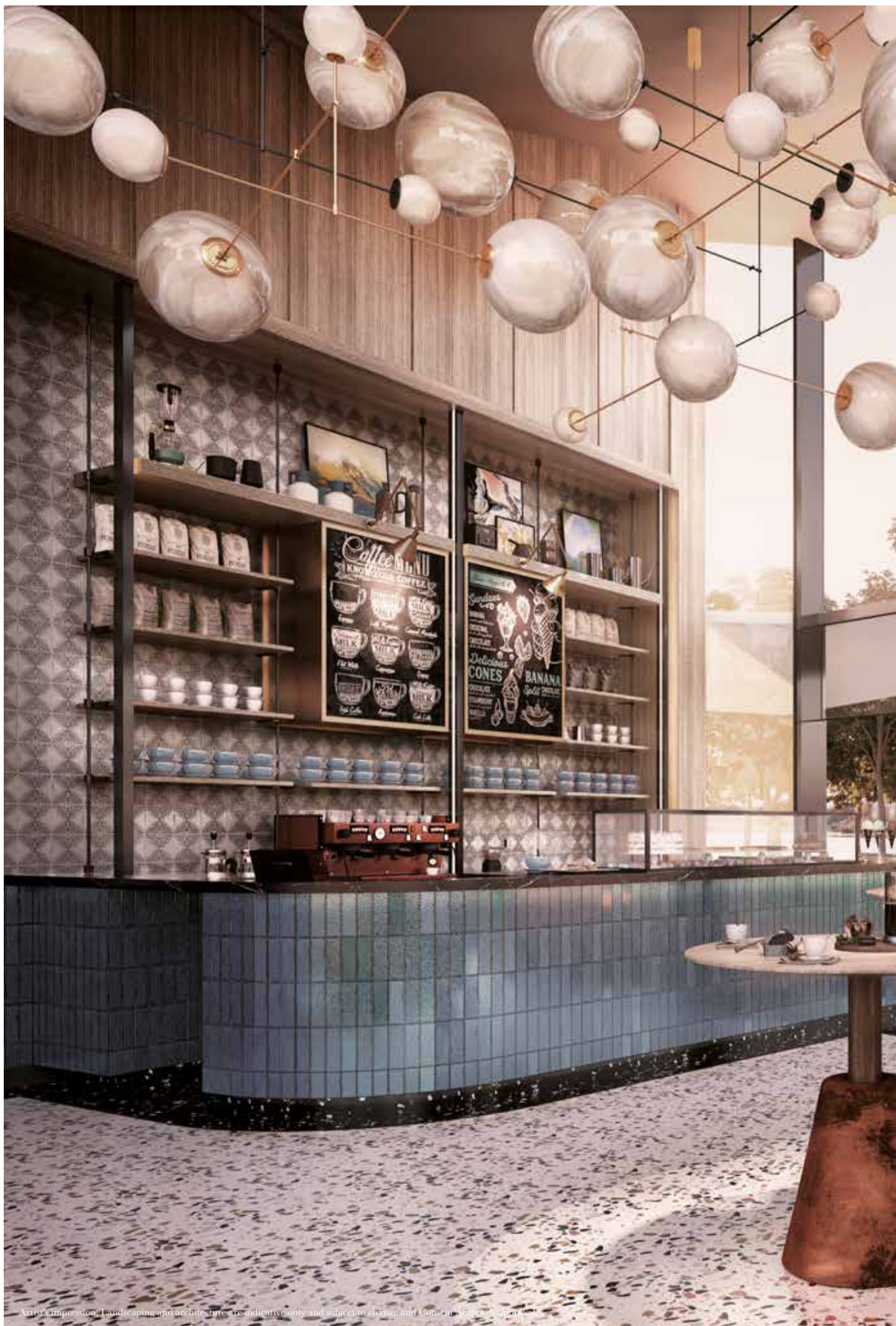
Artist's impression. Landscaping and architecture are indicative only and subject to change and Consent Authority approval.