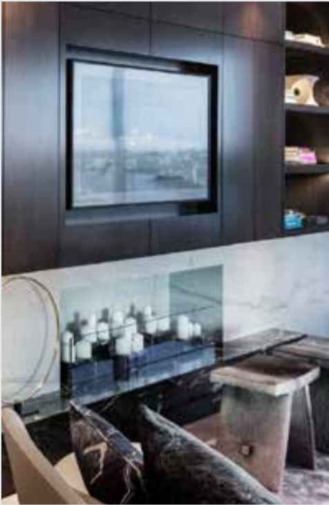
INTEGRATED ETHANOL FIREPLACE