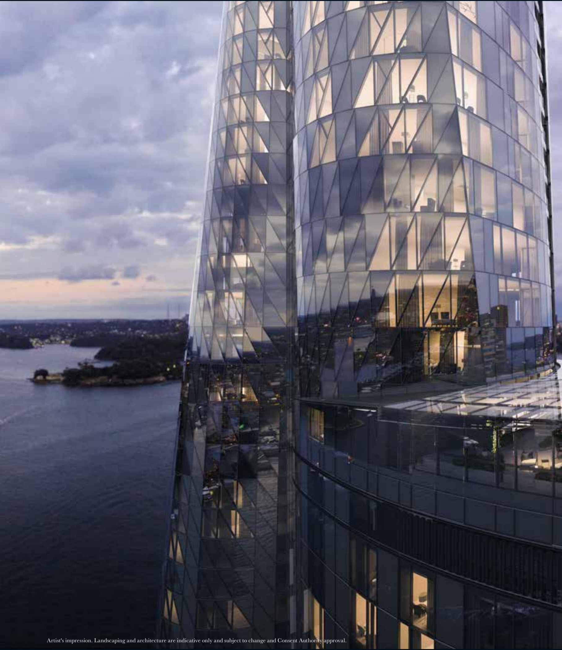
Artist's impression. Landscaping and architecture are indicative only and subject to change and Consent Authority approval.