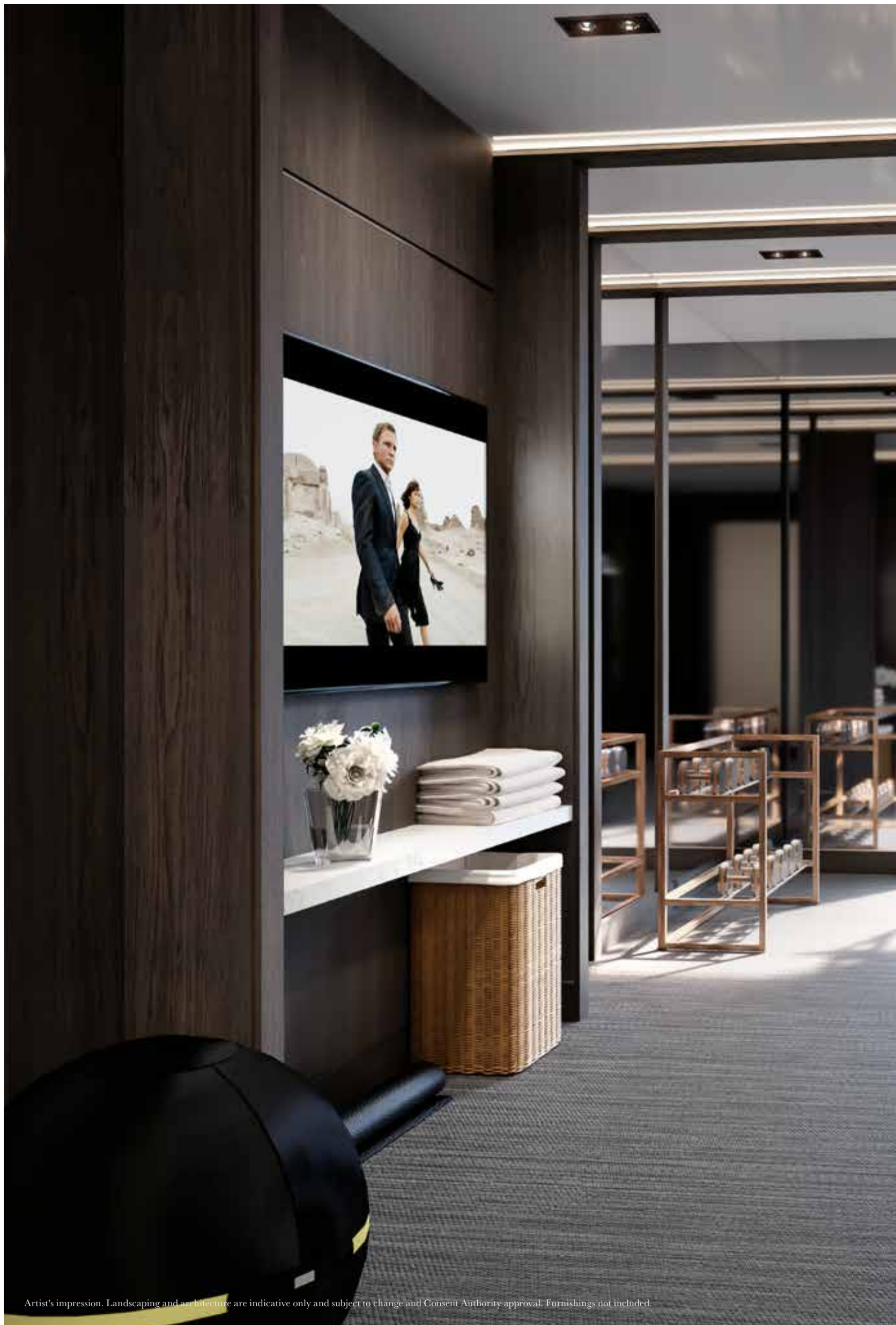
Artist's impression. Landscaping and architecture are indicative only and subject to change and Consent Authority approval. Furnishings not included.