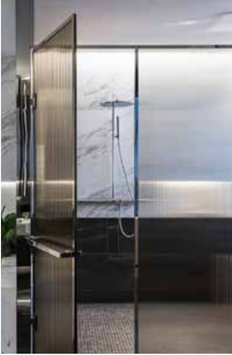
CUSTOM GLASS SHOWER ENCLOSURES