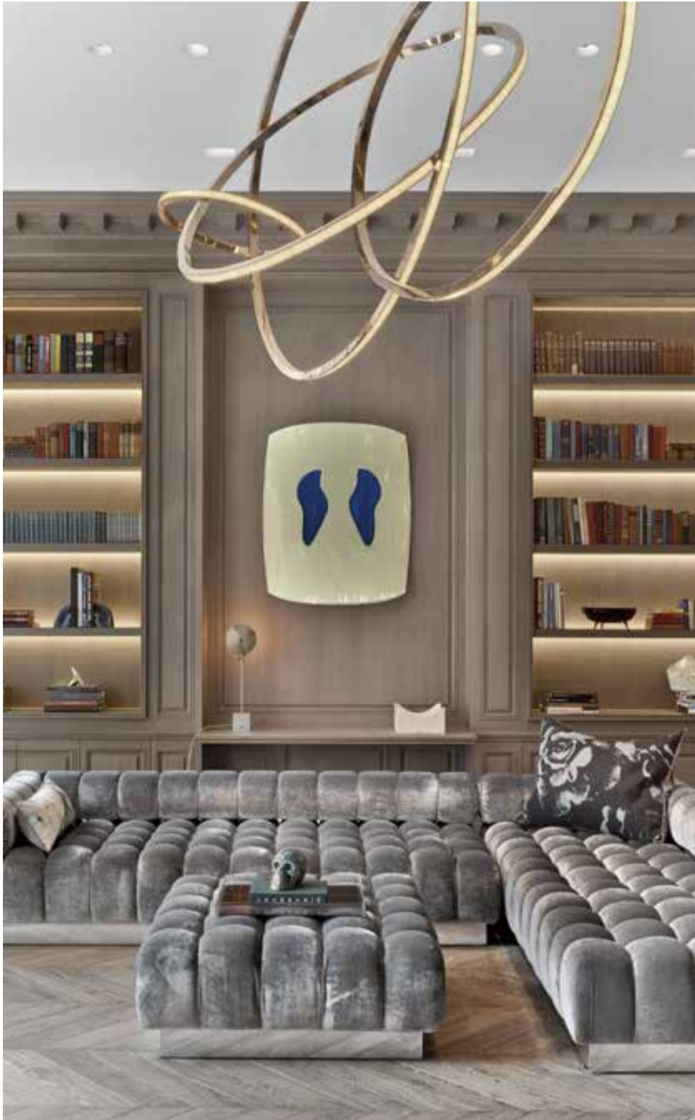
NEW YORK HOUSE