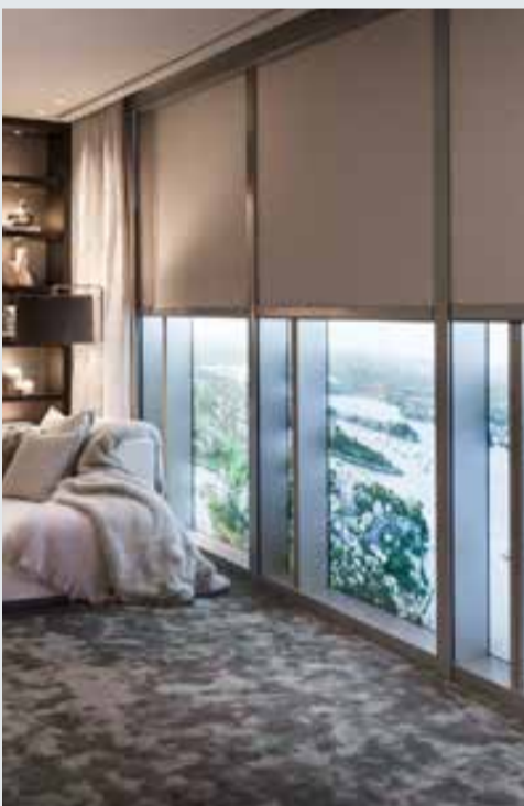
MOTORISED WINDOW TREATMENTS