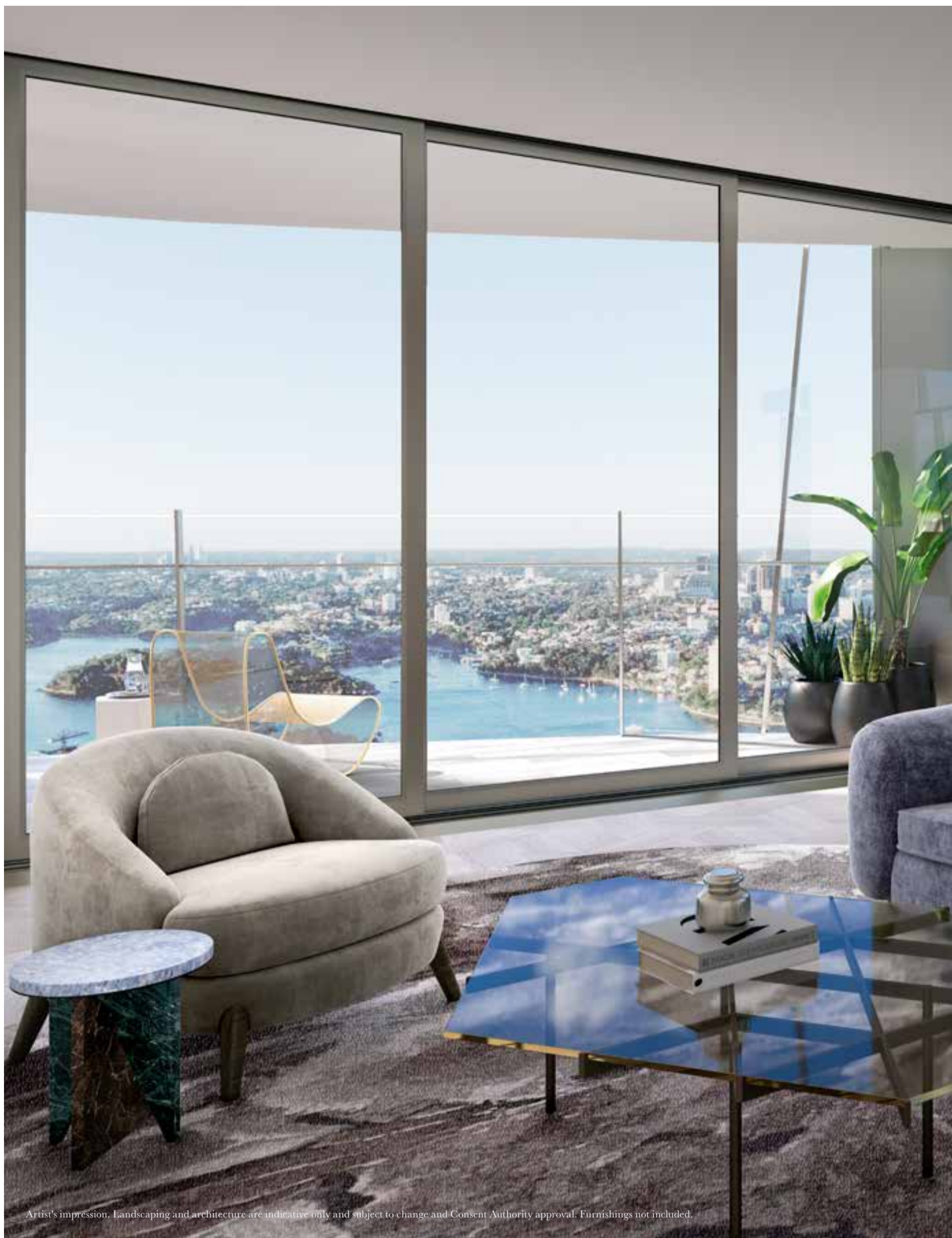
Artist's impression. Landscaping and architecture are indicative only and subject to change and Consent Authority approval. Furnishings not included.