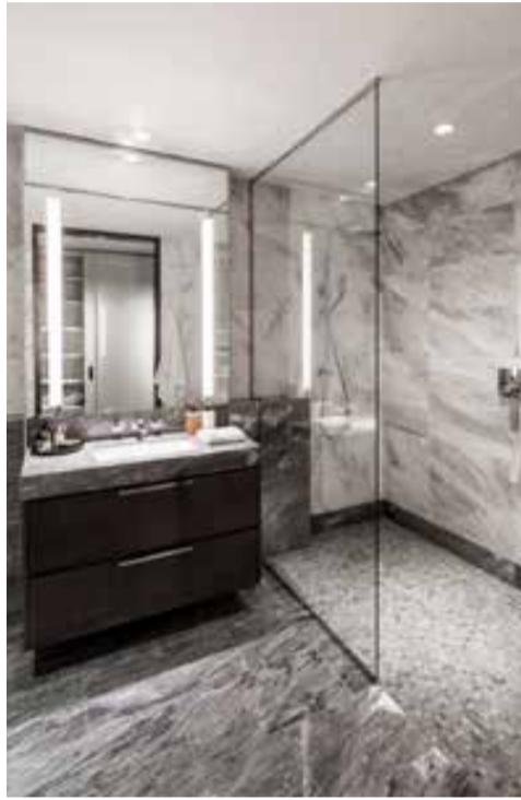
NATURAL STONE TILES TO FLOORS AND WALLS