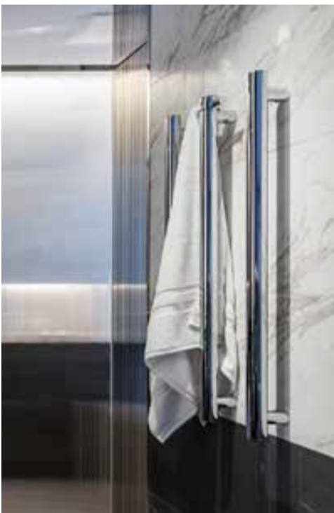
HEATED TOWEL RAILS