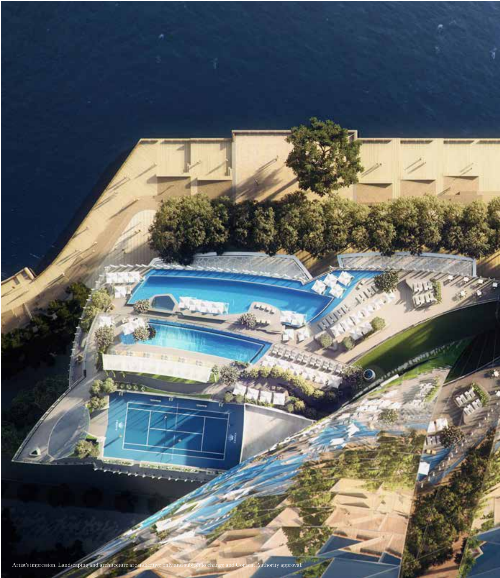
Artist's impression. Landscaping and architecture are indicative only and subject to change and Consent Authority approval.