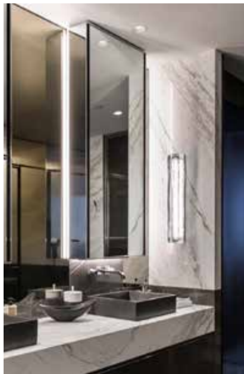
CAST STONE DOUBLE BASINS ON NATURAL STONE VANITY UNITS