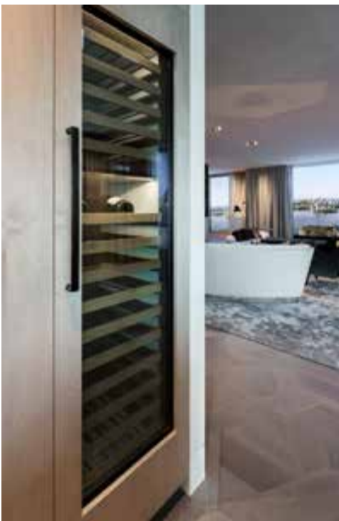
SUB-ZERO WINE REFRIGERATOR