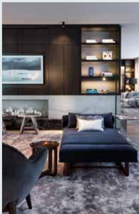
TV WALL JOINERY