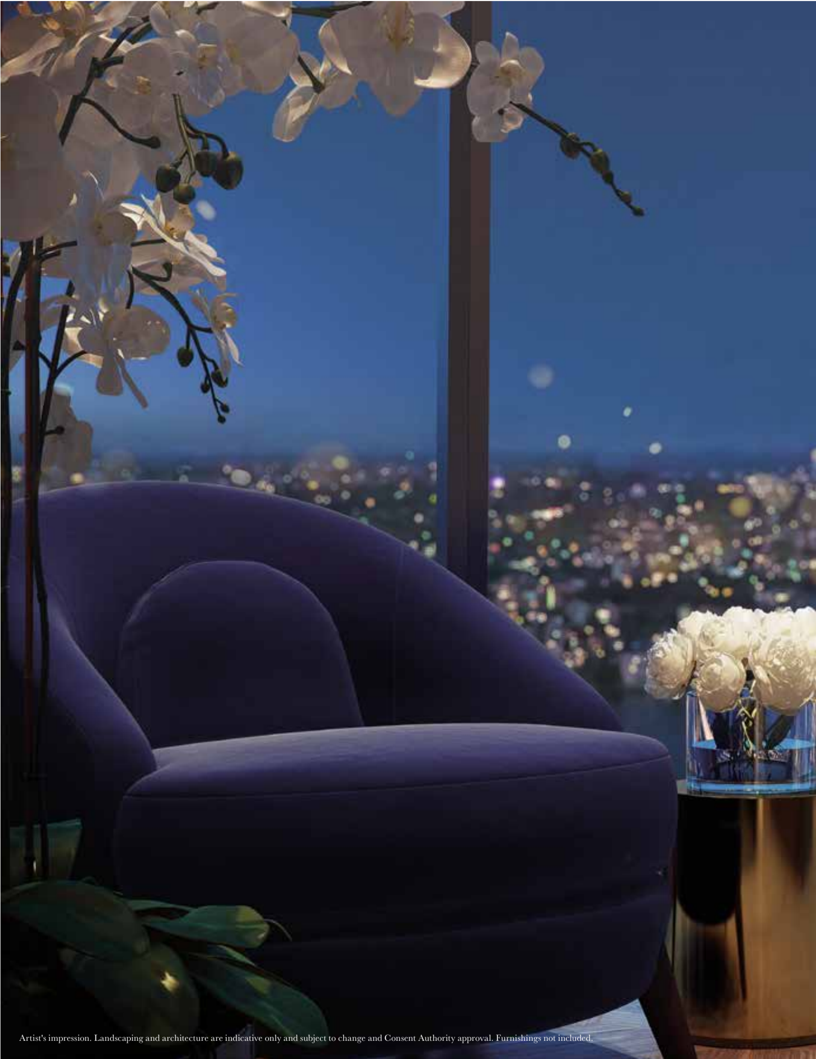
Artist's impression. Landscaping and architecture are indicative only and subject to change and Consent Authority approval. Furnishings not included.