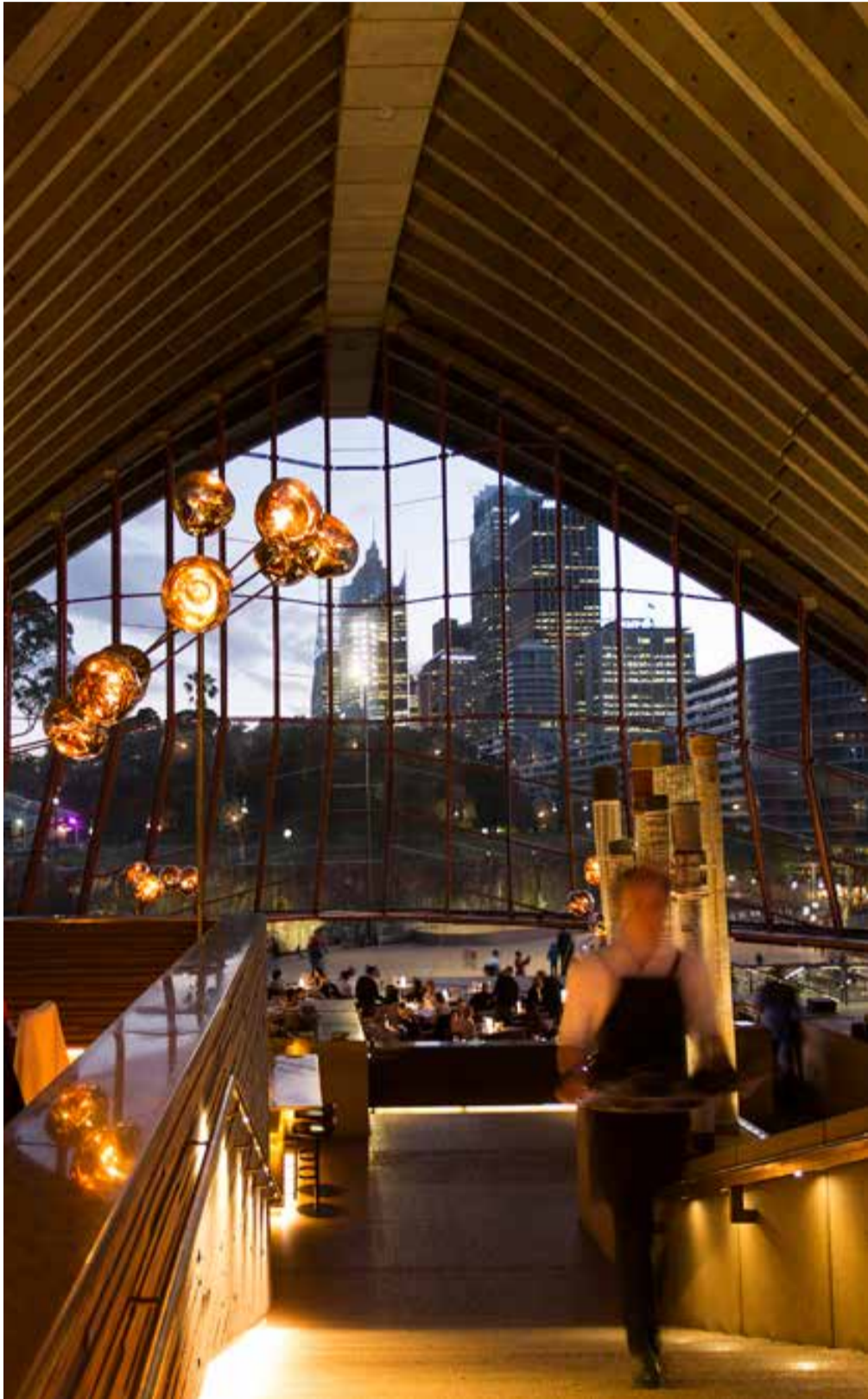
SYDNEY OPERA HOUSE