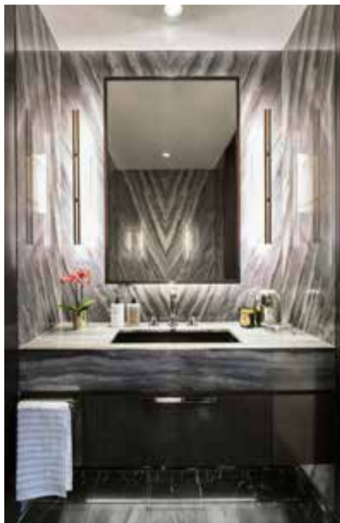
MIRRORED VANITY CABINETS WITH INTEGRATED LED LIGHTING