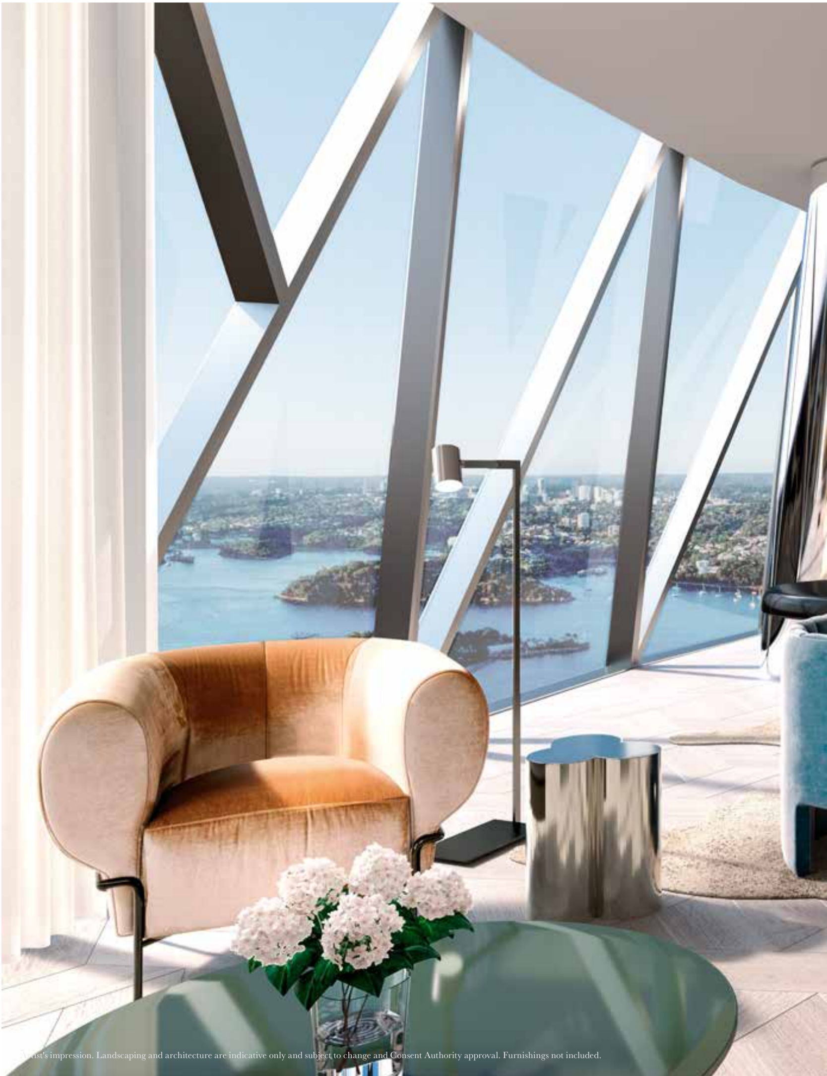
Artist's impression. Landscaping and architecture are indicative only and subject to change and Consent Authority approval. Furnishings not included.