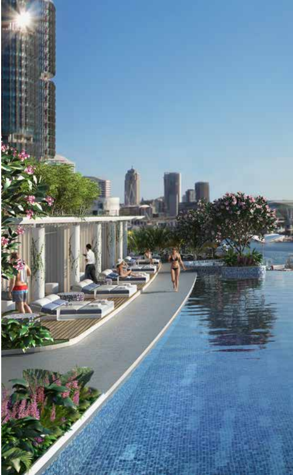
Artist's impression. Landscaping and architecture are indicative only and subject to change and Consent Authority approval.