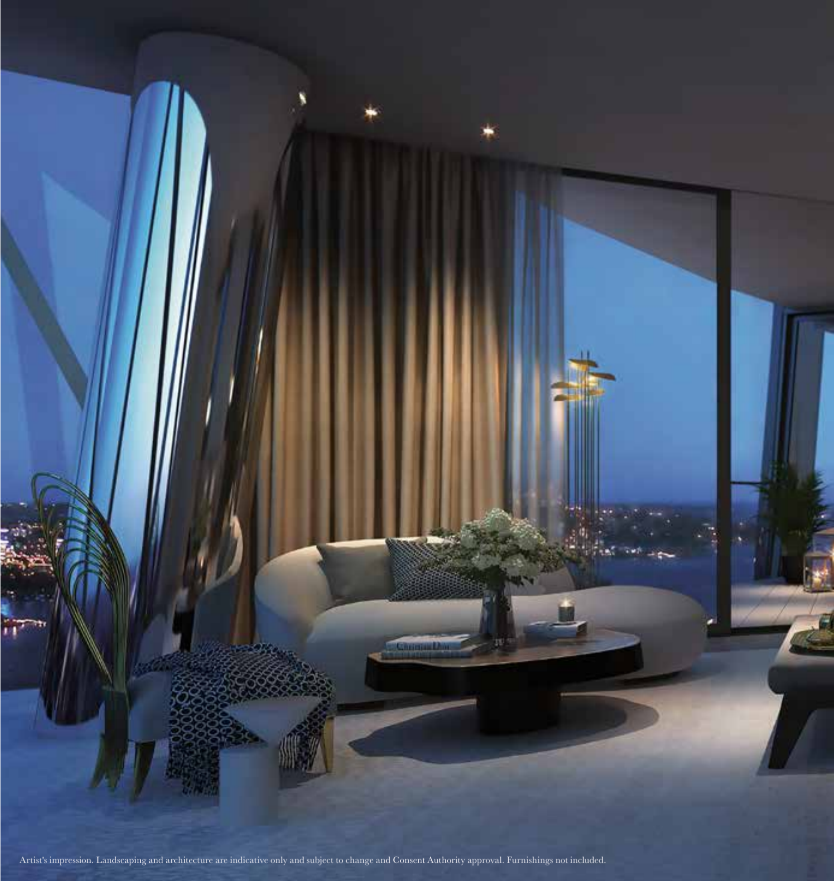
Artist's impression. Landscaping and architecture are indicative only and subject to change and Consent Authority approval. Furnishings not included.