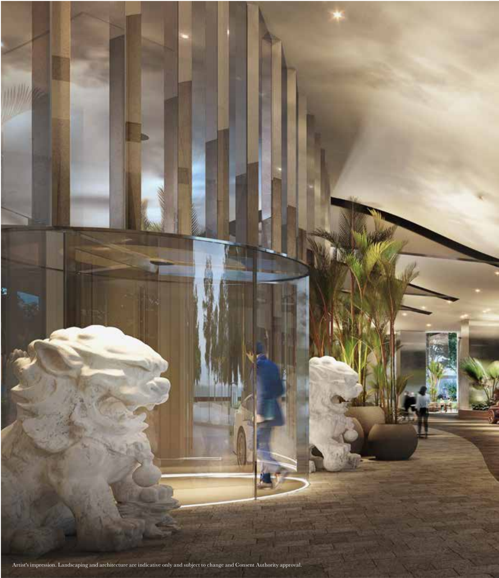
Artist's impression. Landscaping and architecture are indicative only and subject to change and Consent Authority approval.