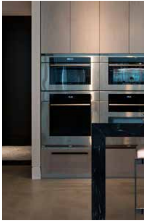
INTEGRATED WOLF APPLIANCES