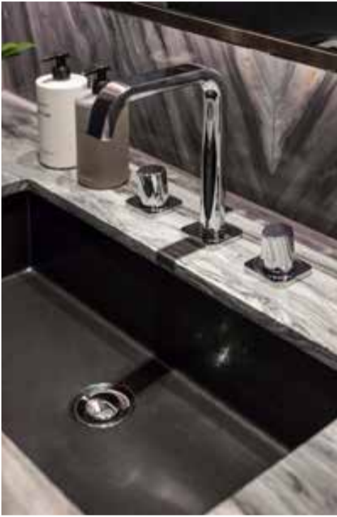
CAST STONE BASIN WITH NATURAL STONE VANITY TOP