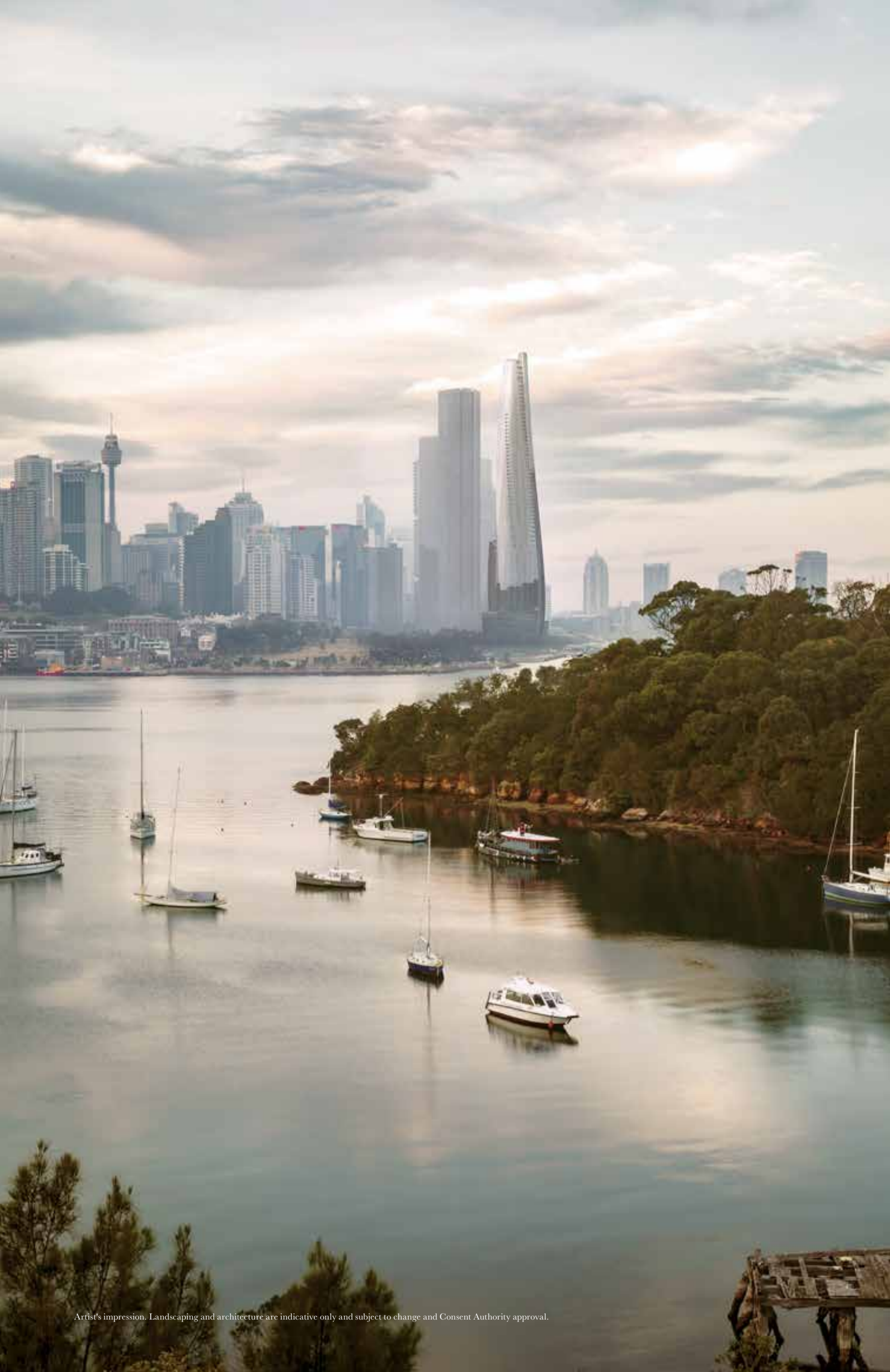
Artist's impression. Landscaping and architecture are indicative only and subject to change and Consent Authority approval.