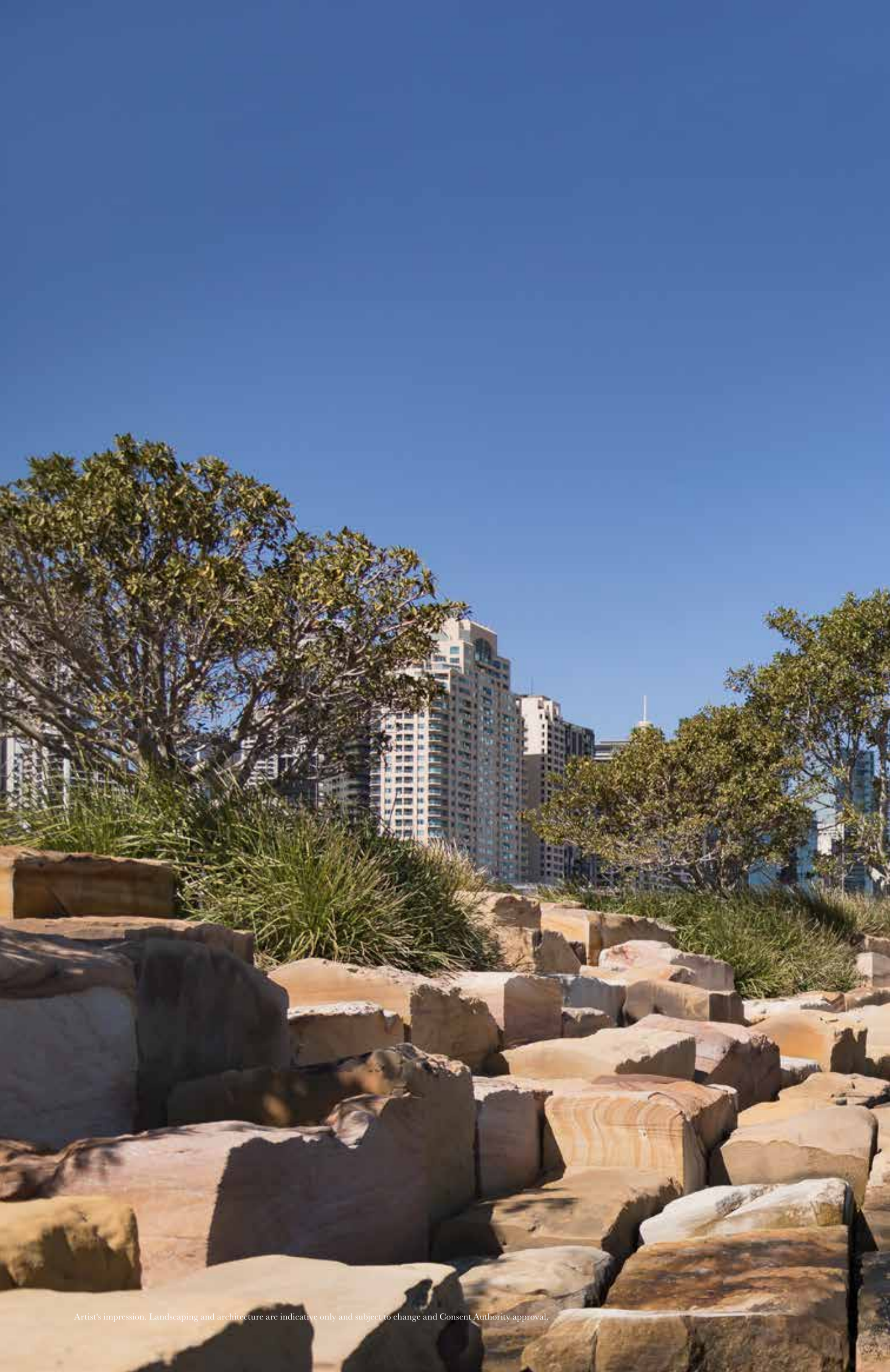
Artist's impression. Landscaping and architecture are indicative only and subject to change and Consent Authority approval.