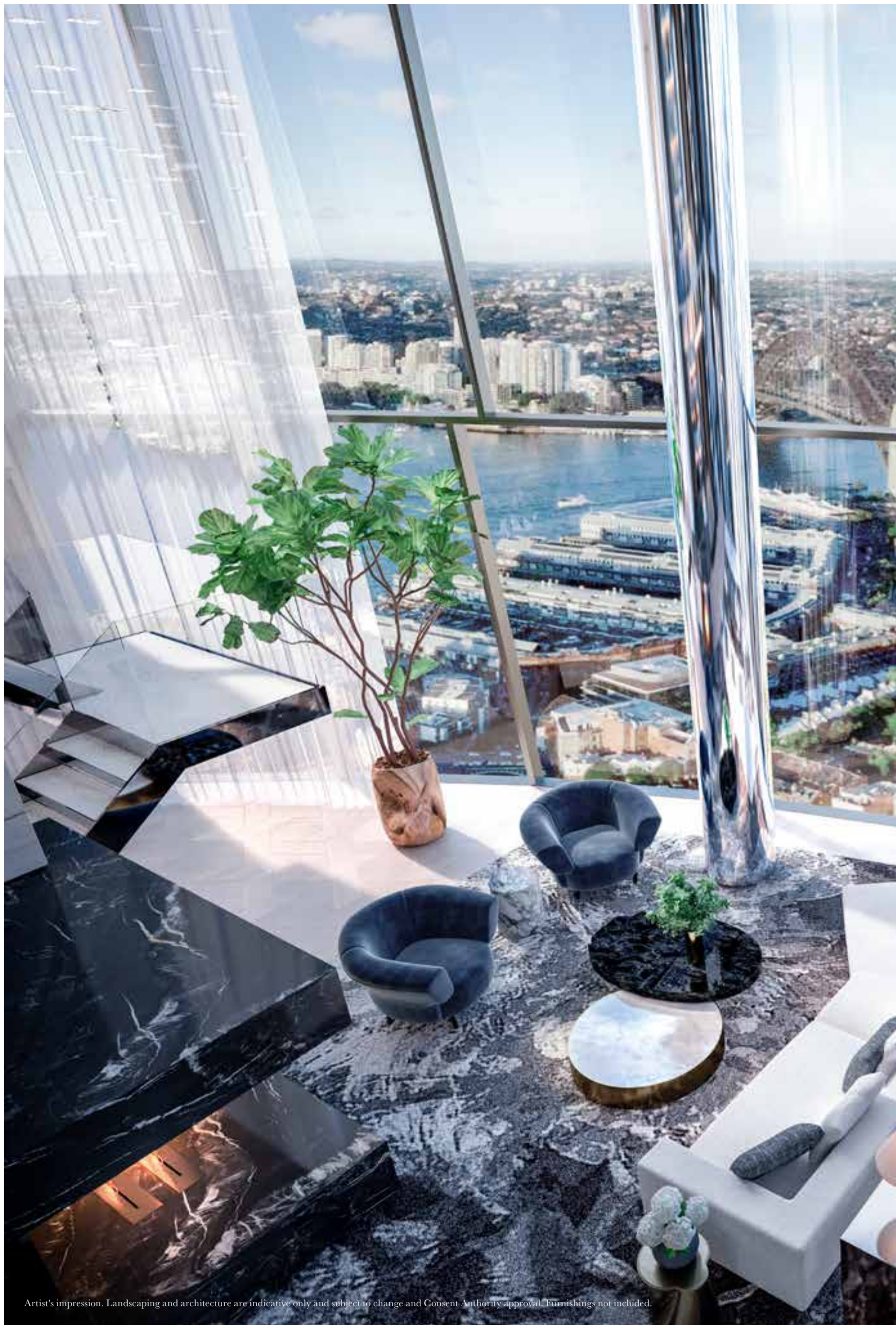
Artist's impression. Landscaping and architecture are indicative only and subject to change and Consent Authority approval. Furnishings not included.