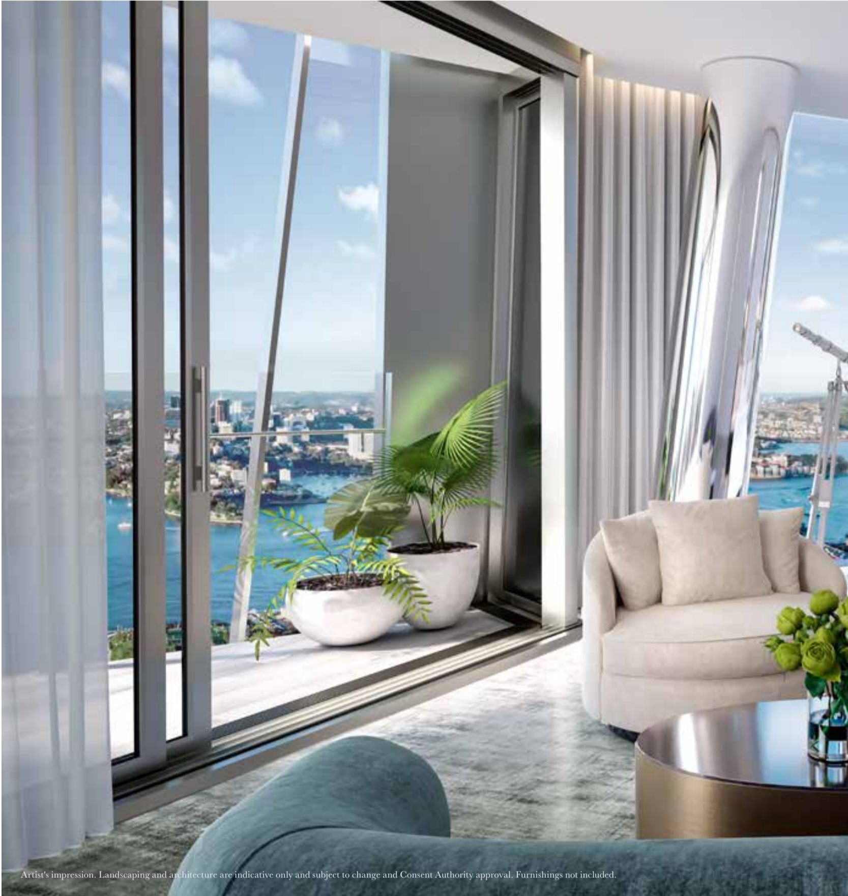
Artist's impression. Landscaping and architecture are indicative only and subject to change and Consent Authority approval. Furnishings not included.