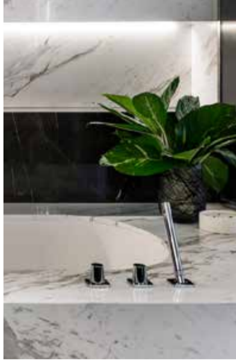
GERMAN ENGINEERED TAPWARE BY HANSGROHE