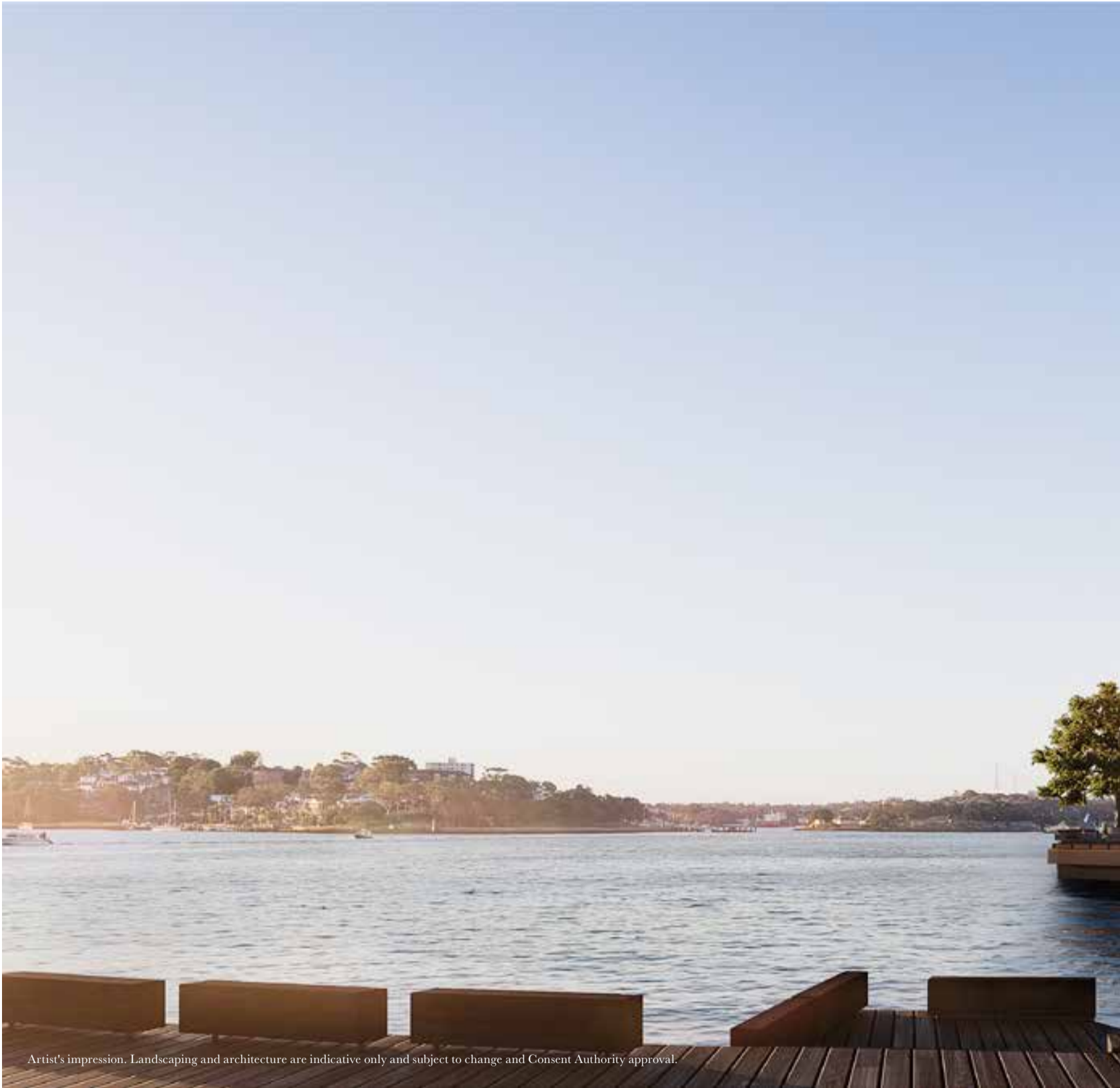
Artist's impression. Landscaping and architecture are indicative only and subject to change and Consent Authority approval.