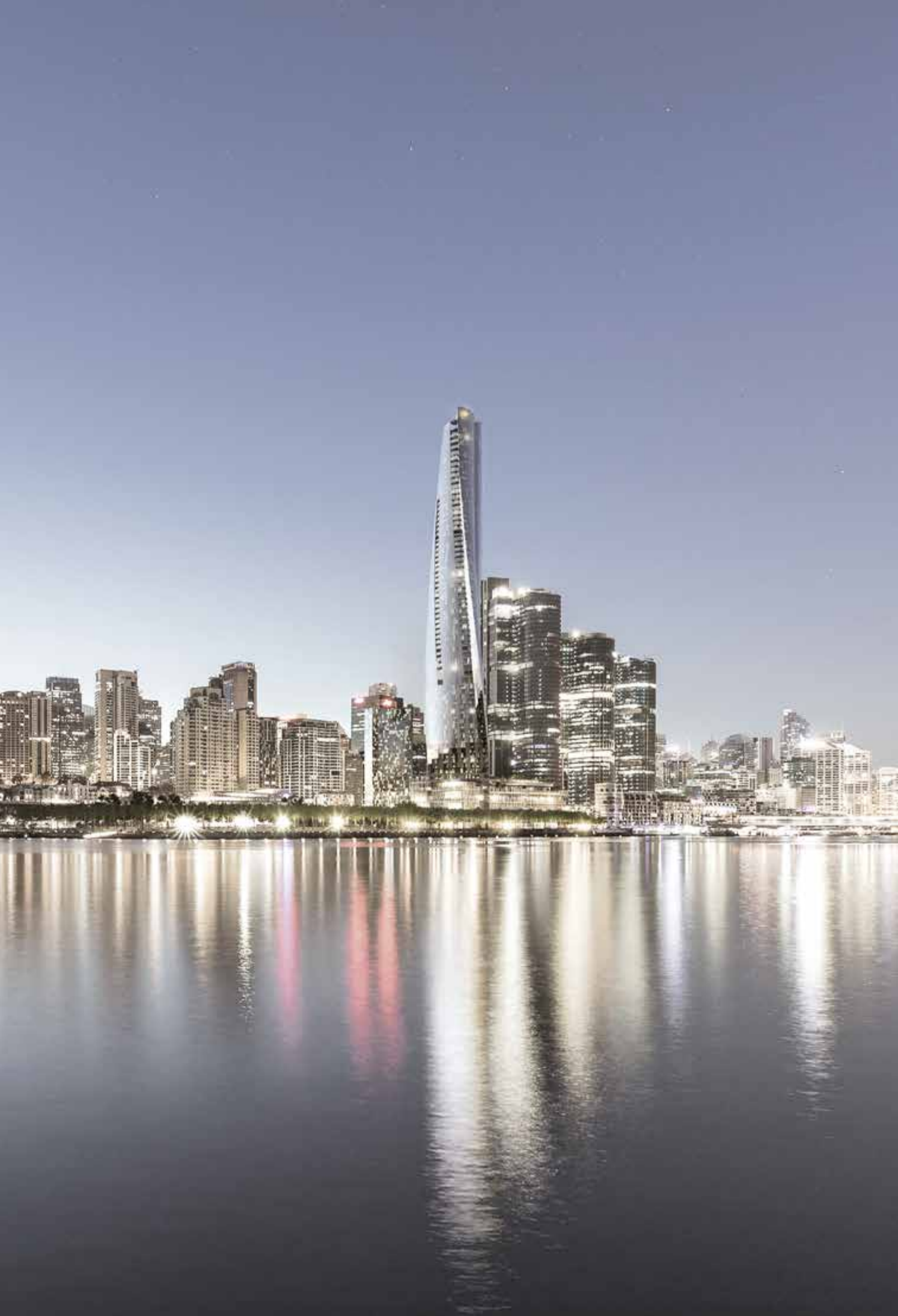
Artist's impression. Landscaping and architecture are indicative only and subject to change and Consent Authority approval.