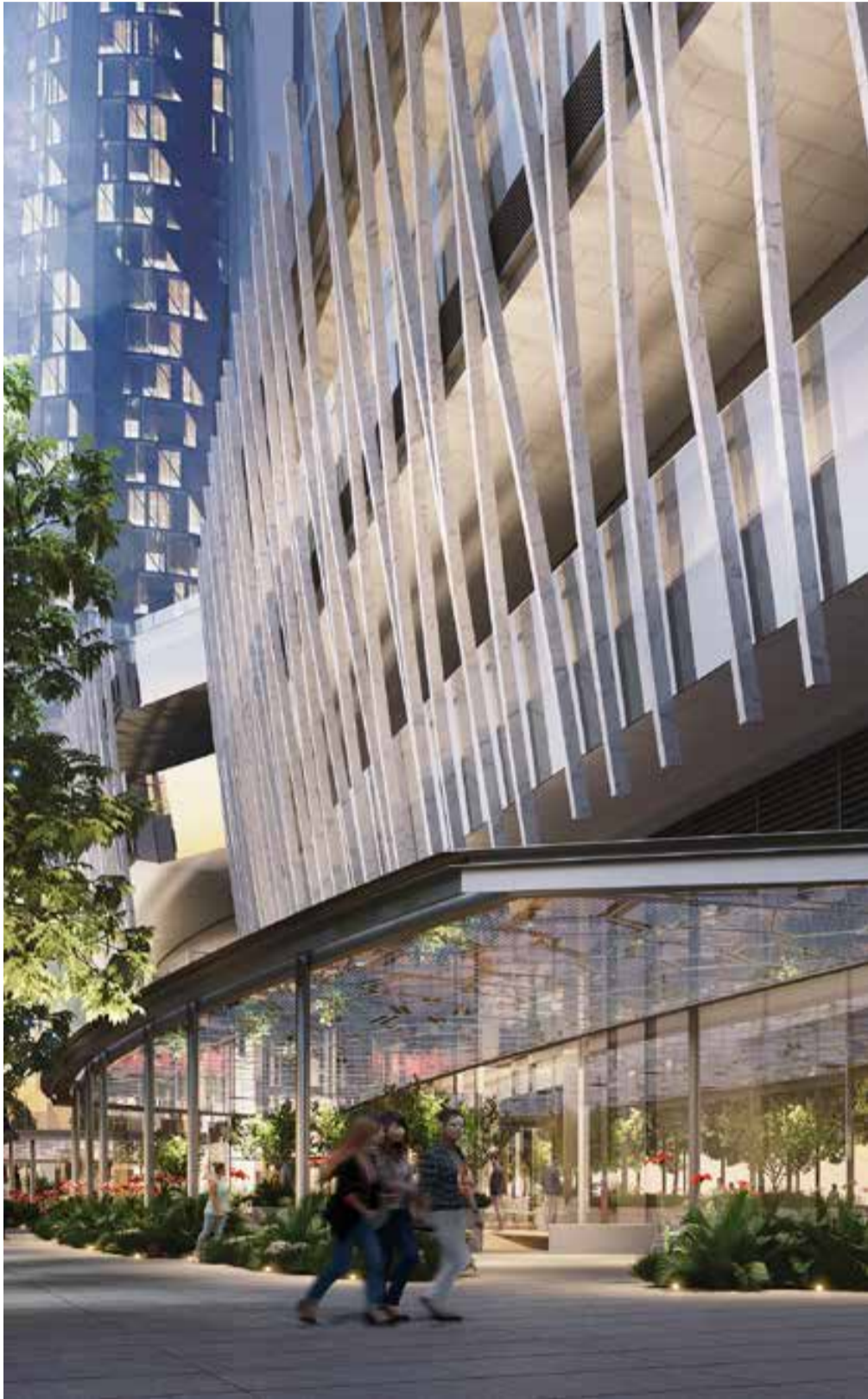
Artist's impression. Landscaping and architecture are indicative only and subject to change and Consent Authority approval.