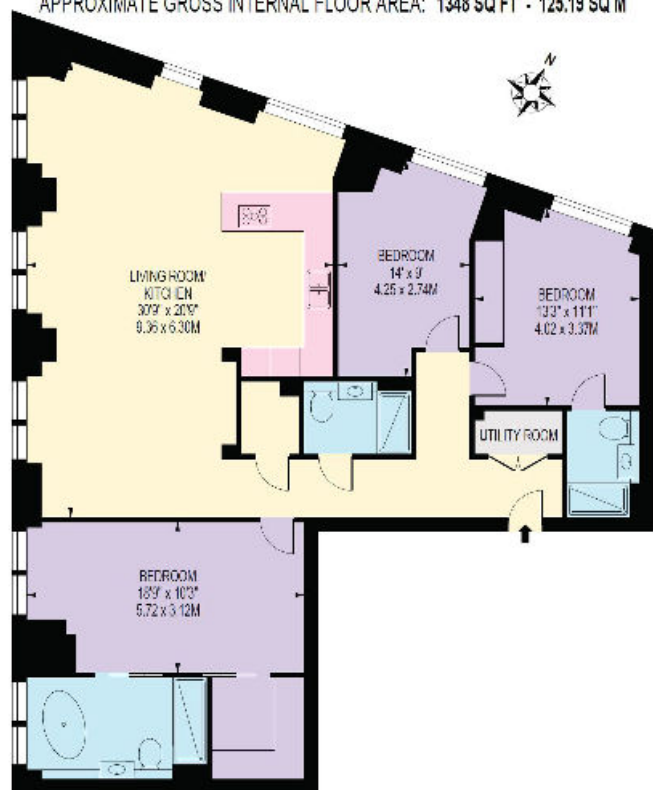
TWENTY FIFTH FLOOR

APPROXIMATE GROSS INTERNAL FLOOR AREA: 1348 SQ FT - 125.19 SQ M