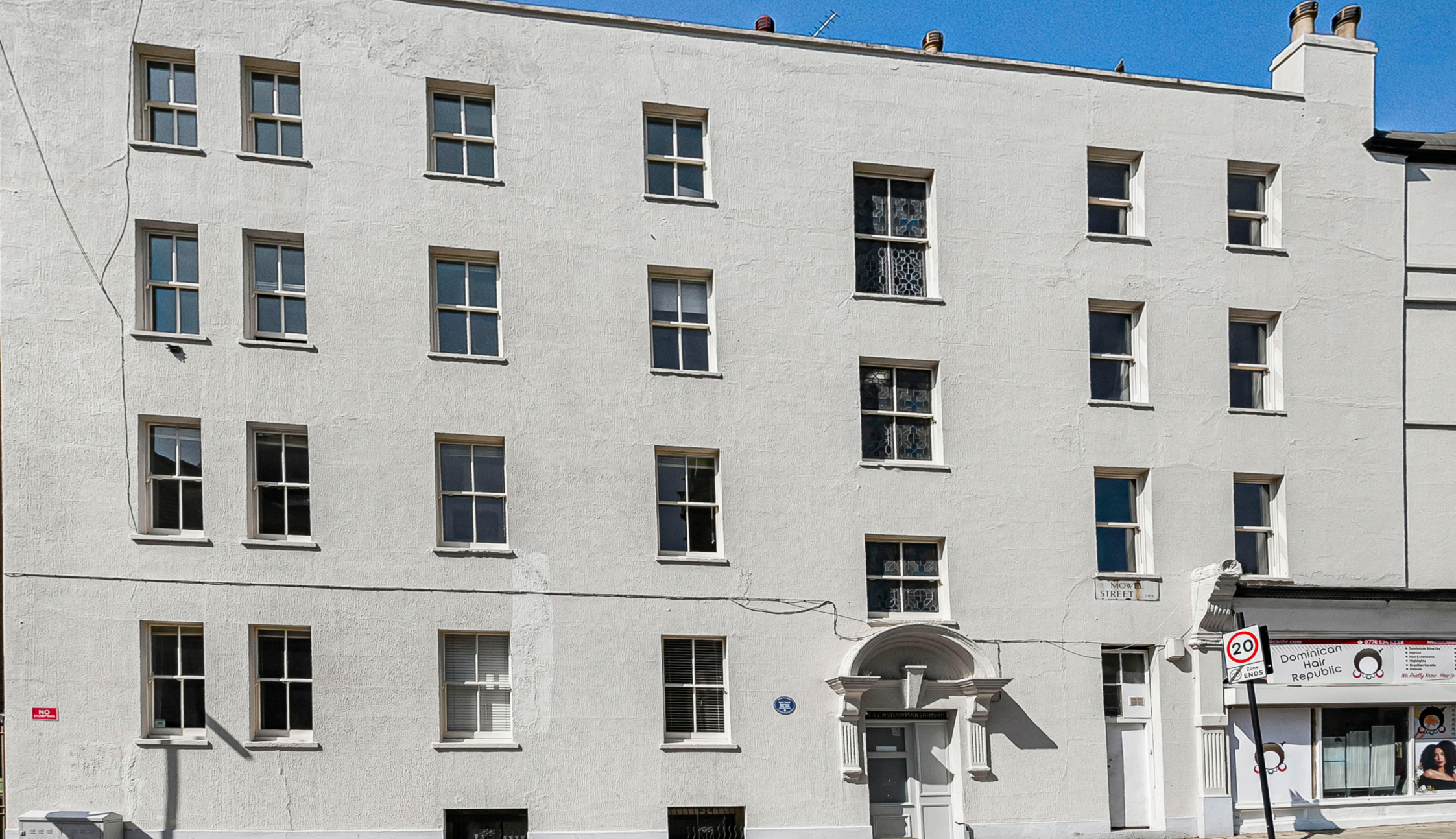
Glenshaw Mansion, London SW9