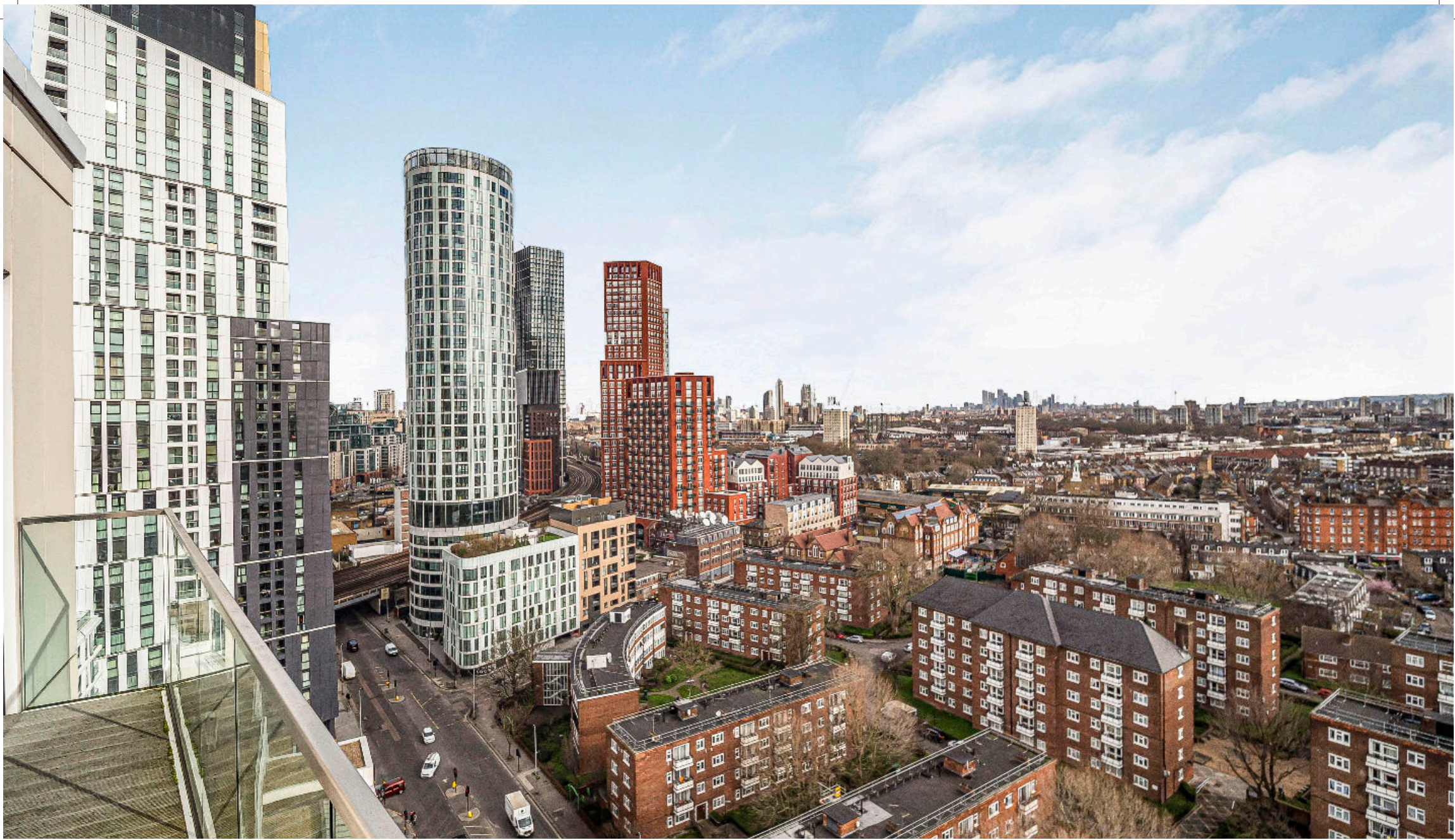
Pinto Tower, Battersea SW6