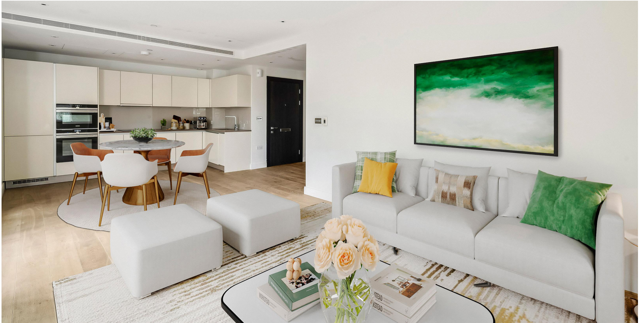
CASCADE COURT London, SW11