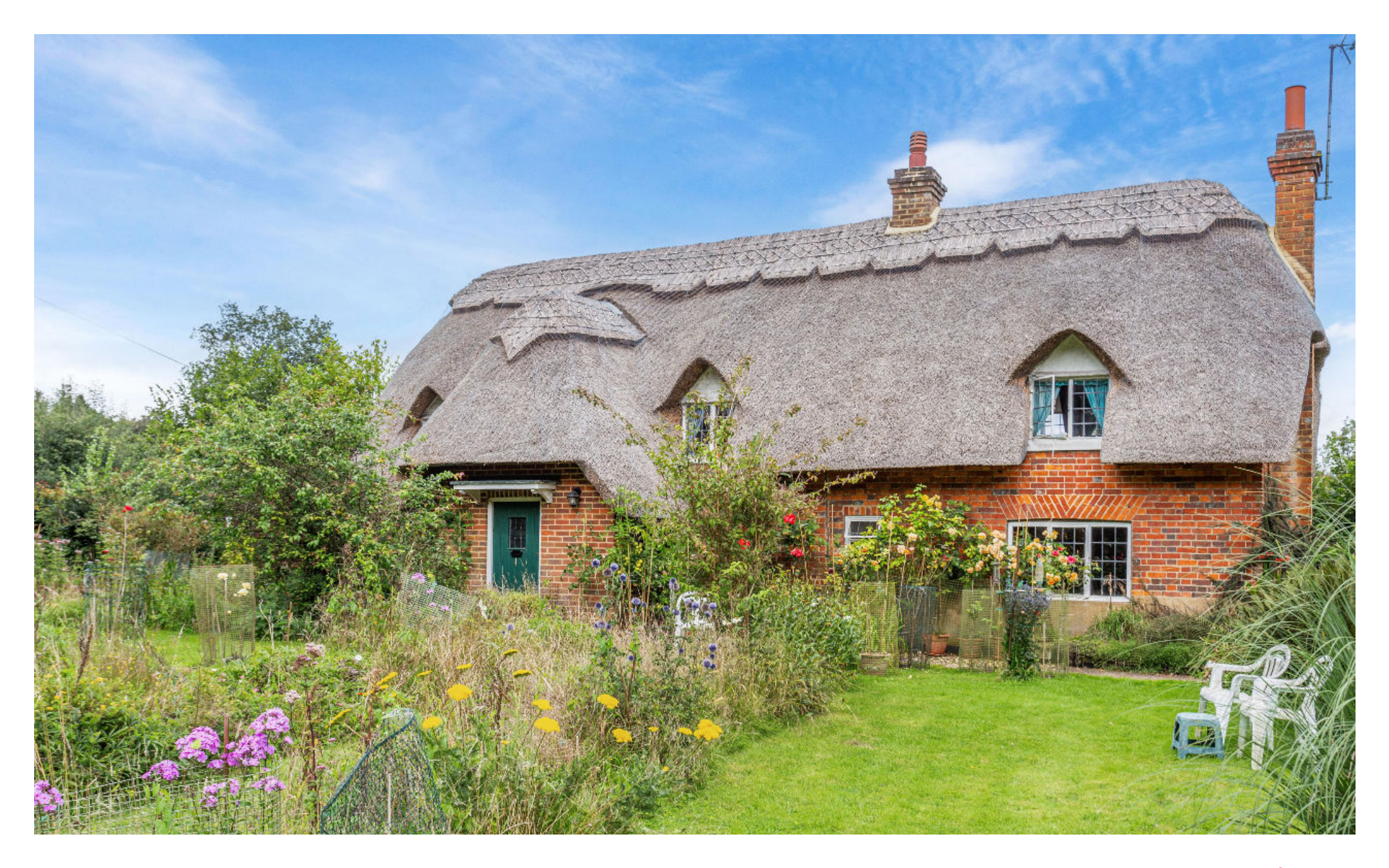
Ferns Cottage, Great Hampden, Great Missenden