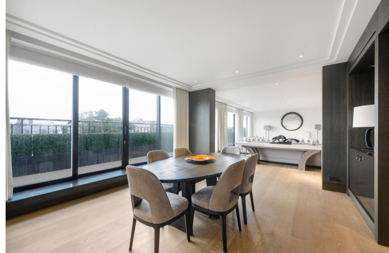
Just a short distance from Victoria station (for Piccadilly, District and Circle lines and Overground services), this property is in a great location. It is also close to the amenities of Elizabeth Street, Motcomb Street, the Kings Road, and Belgravia and Knightsbridge.