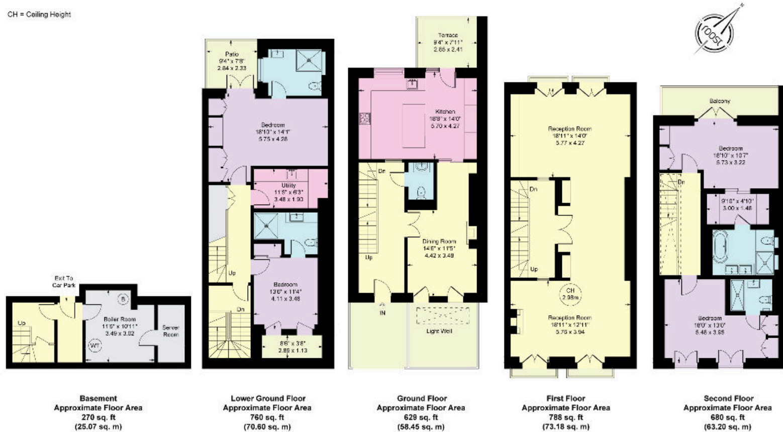
Illustration for identification purposes only. measurements are approximate, not to scale. (ID/1108)

Knight Frank Belgravia & Westminster 82/83 Chester Square London SW1W 9HJ knightfrank.co.uk