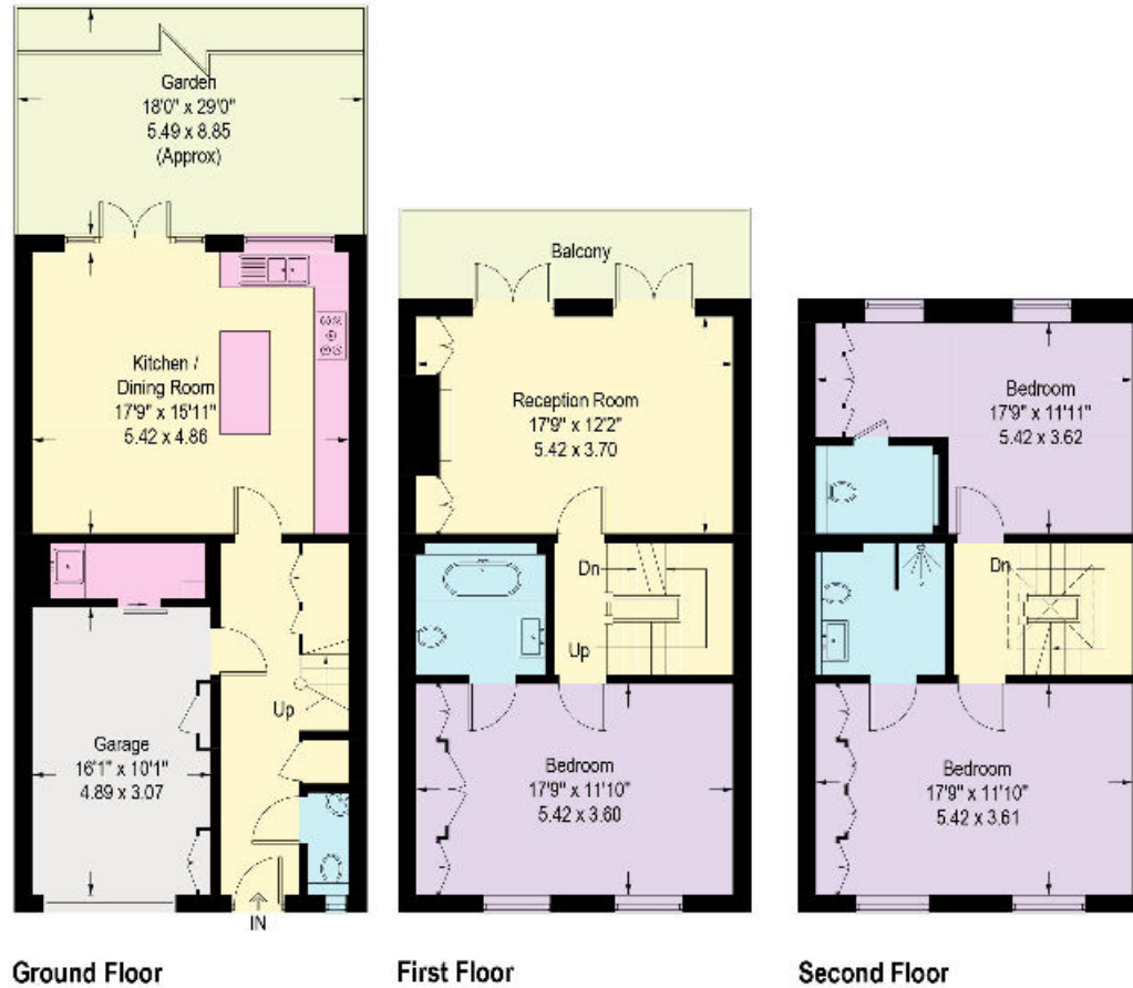
Illustration for identification purposes only. measurements are approximate, not to scale. (ID441365)