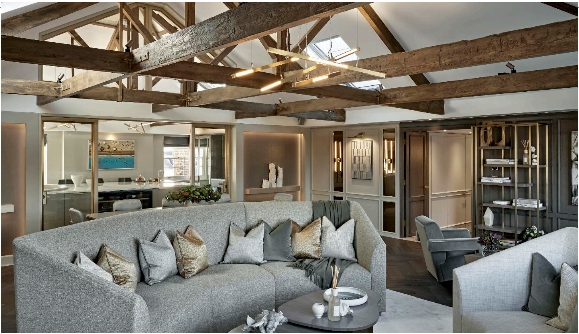
Eaton Square, Belgravia SWIW