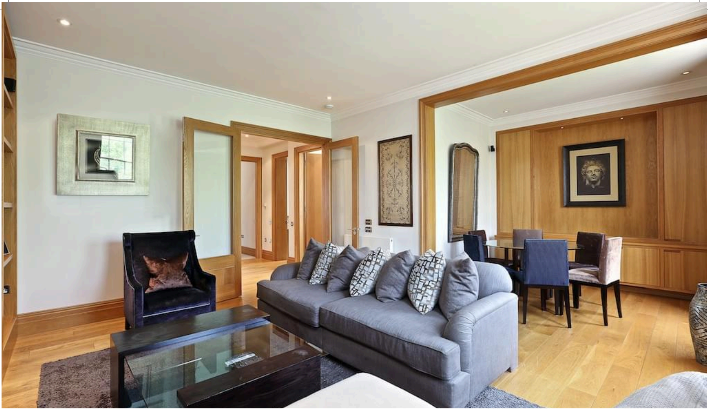
Eaton Square, Belgravia, SW1W