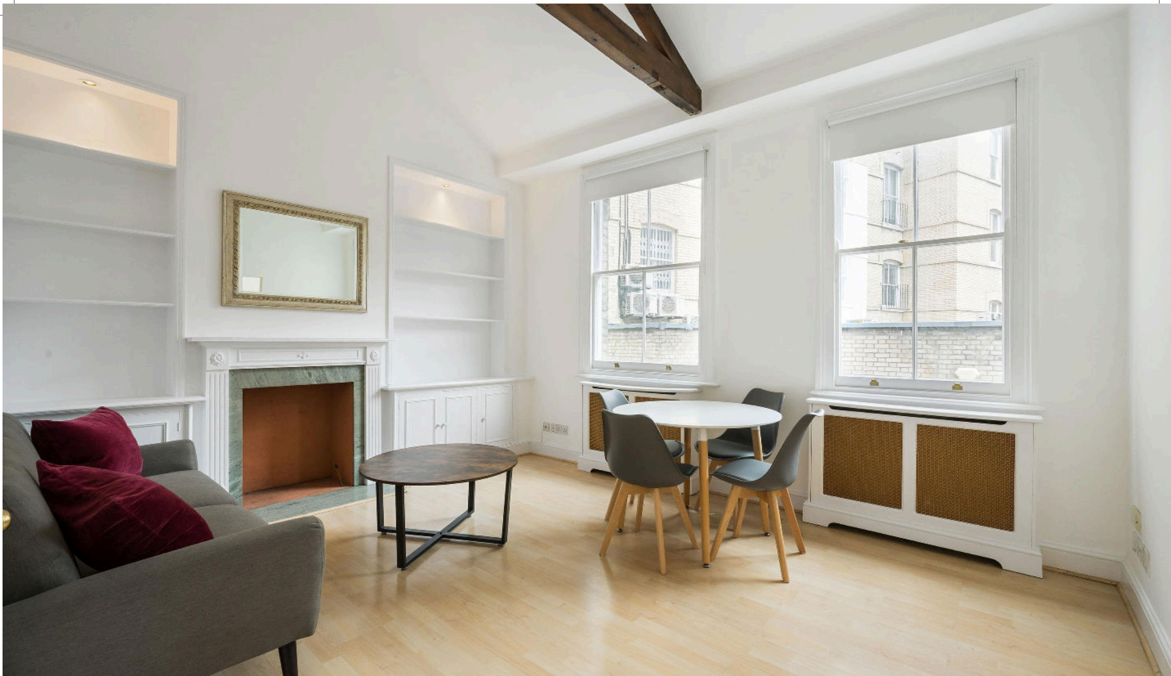
Grosvenor Gardens Mews East, Belgravia SWIW