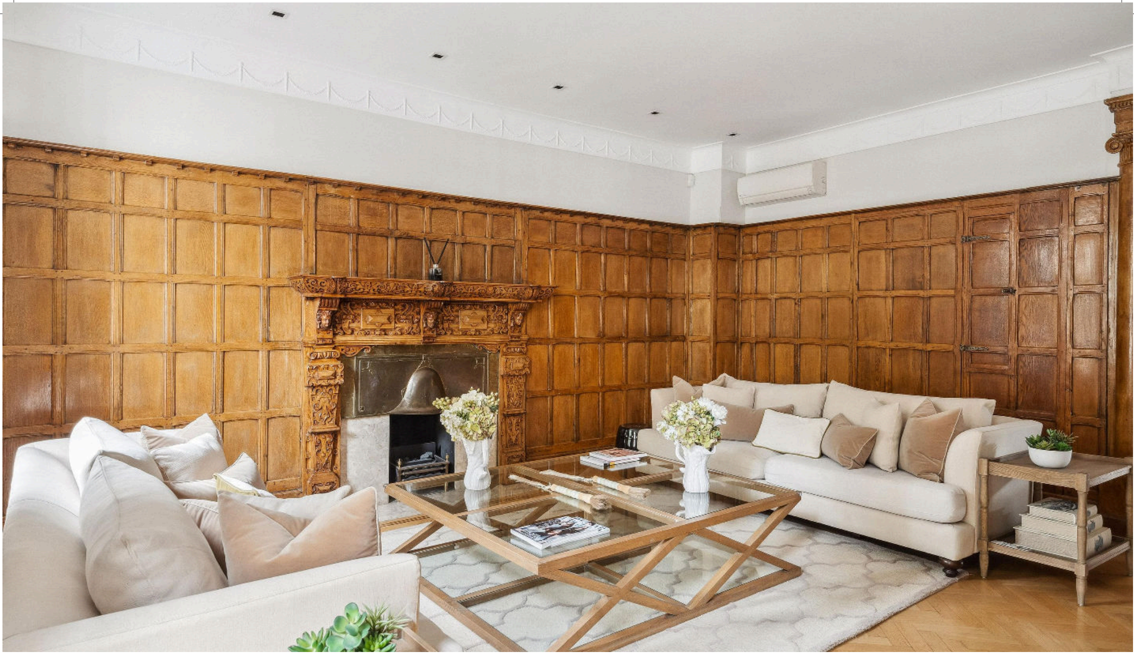
Wilton Place, Belgravia, SWIX