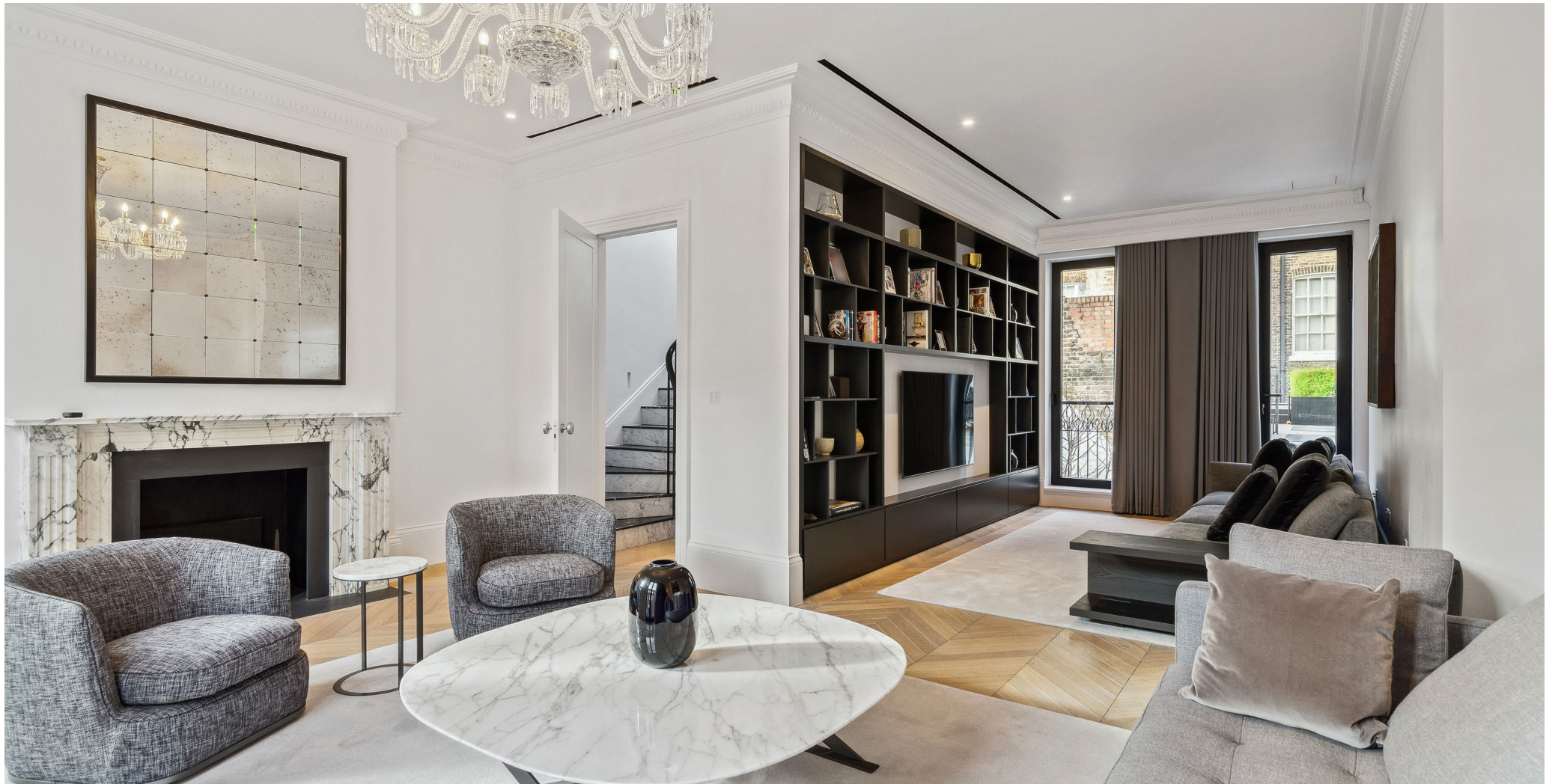
LITTLE CHESTER STREET, Belgravia SW1W