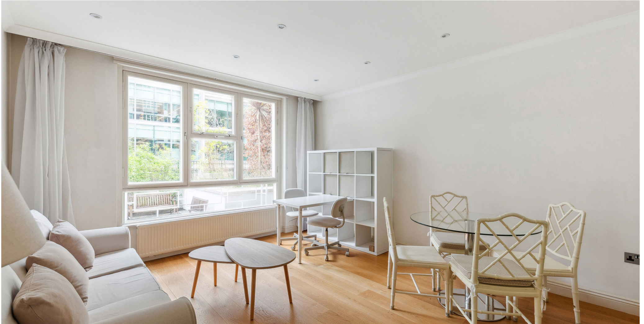
BELGRAVIA COURT, Belgravia SW1W