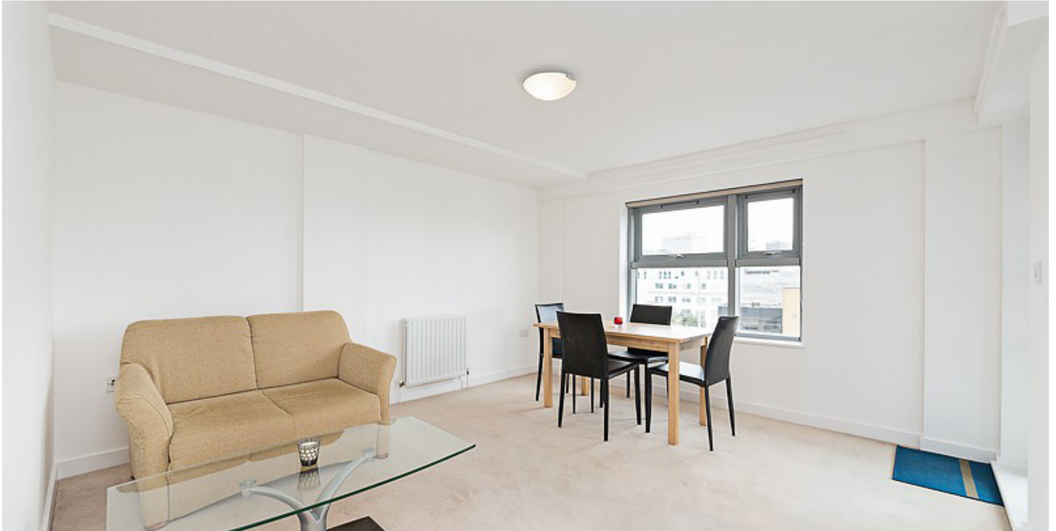
HINDON COURT, Pimlico SW1V