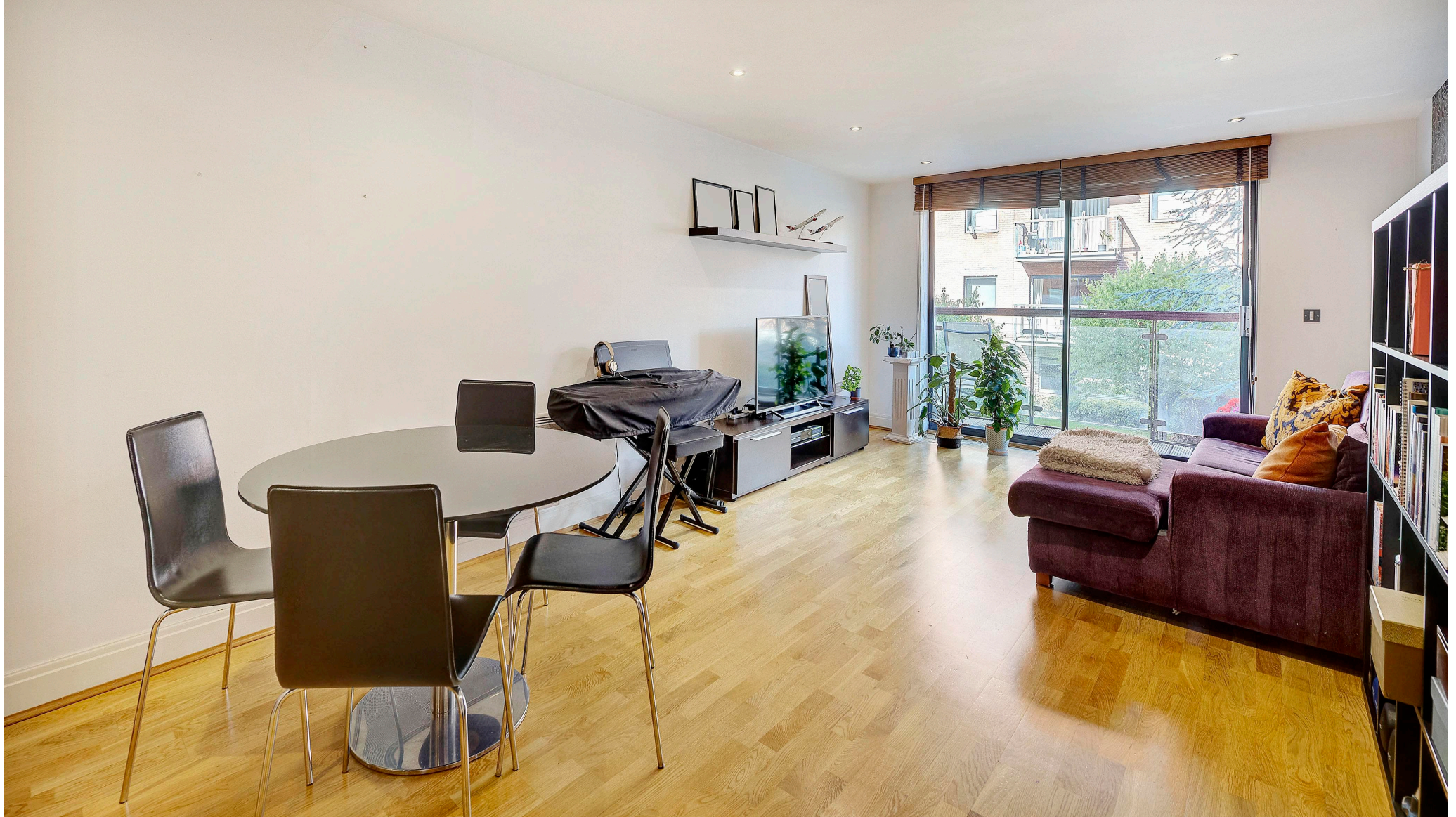
Tounson Court, Montaigne Close Pimlico SWIP