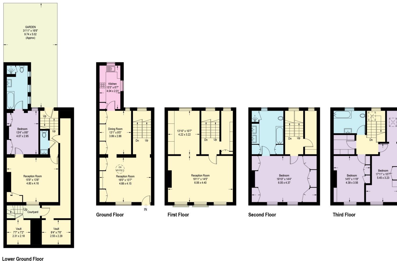
Illustration for identification purposes only, measurements are approximate, not to scale. (ID1020668)

This plan is for guidance only and must not be relied upon as a statement of fact. Attention is drawn to the important notice on the last page of the text of the Particulars.