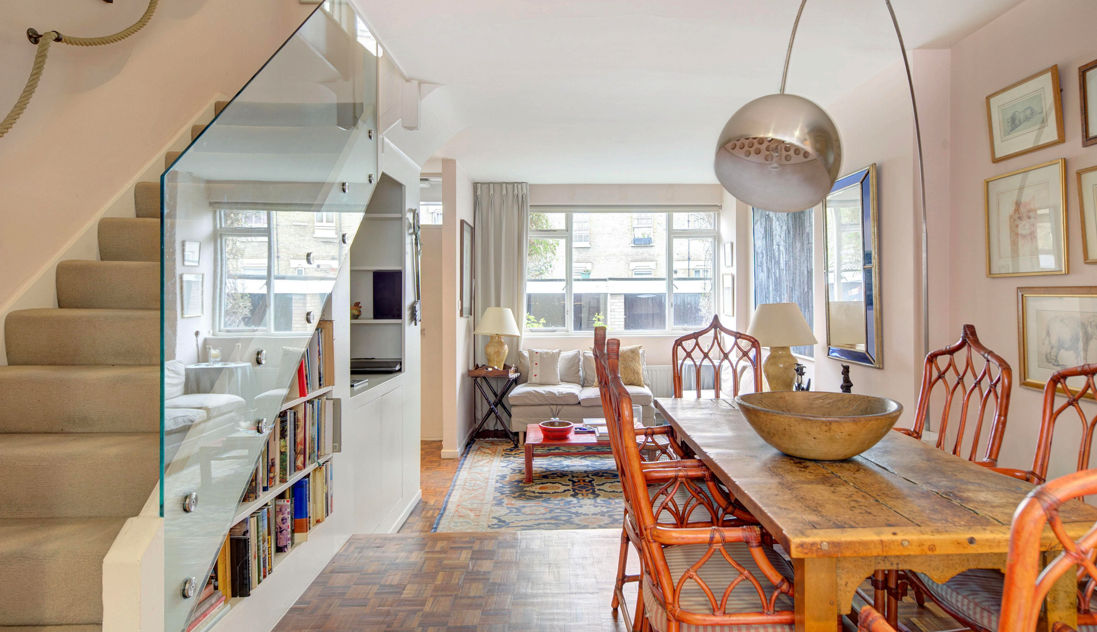
Rembrandt Close, London SW1W