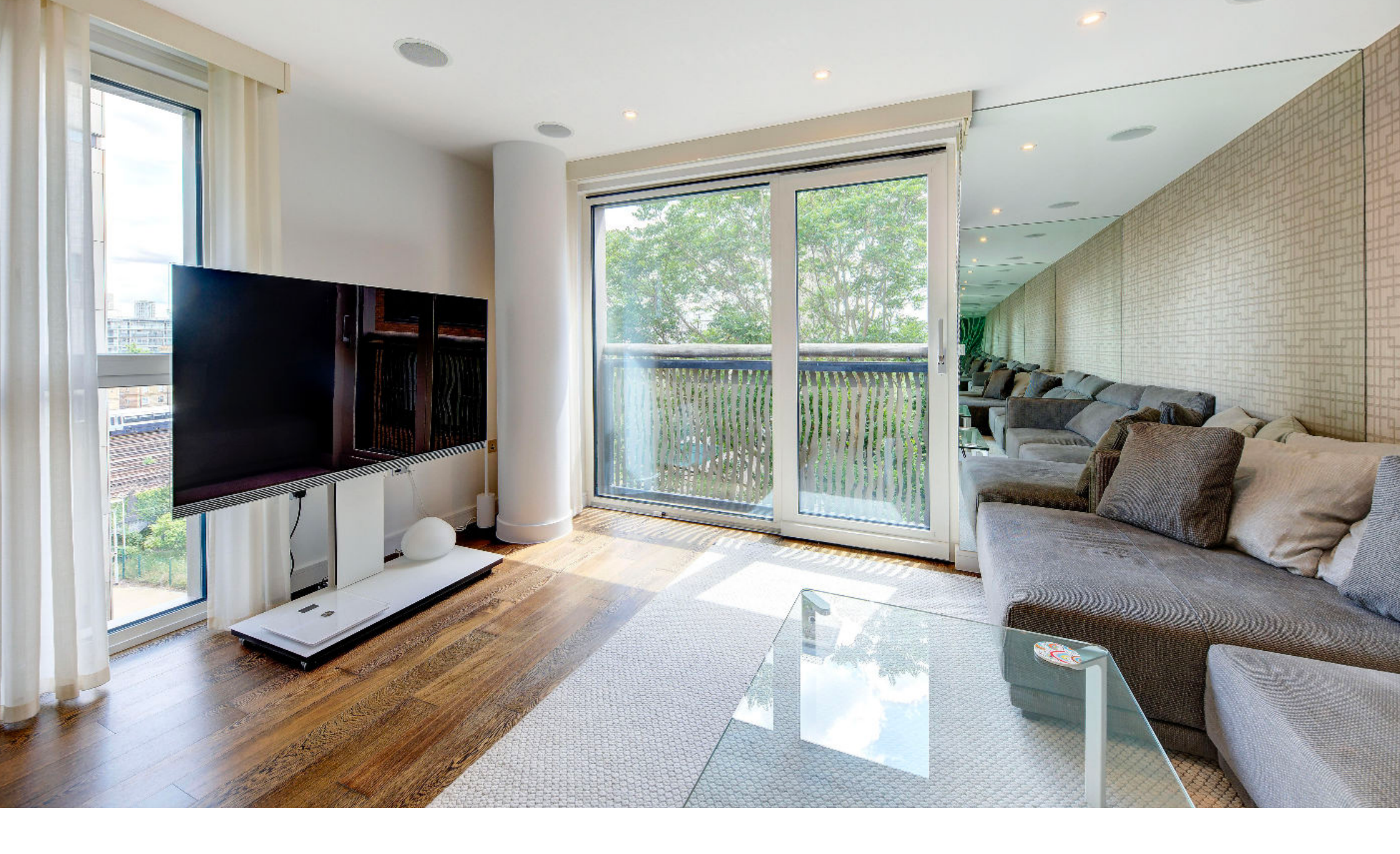
Bramah House, London SWIW