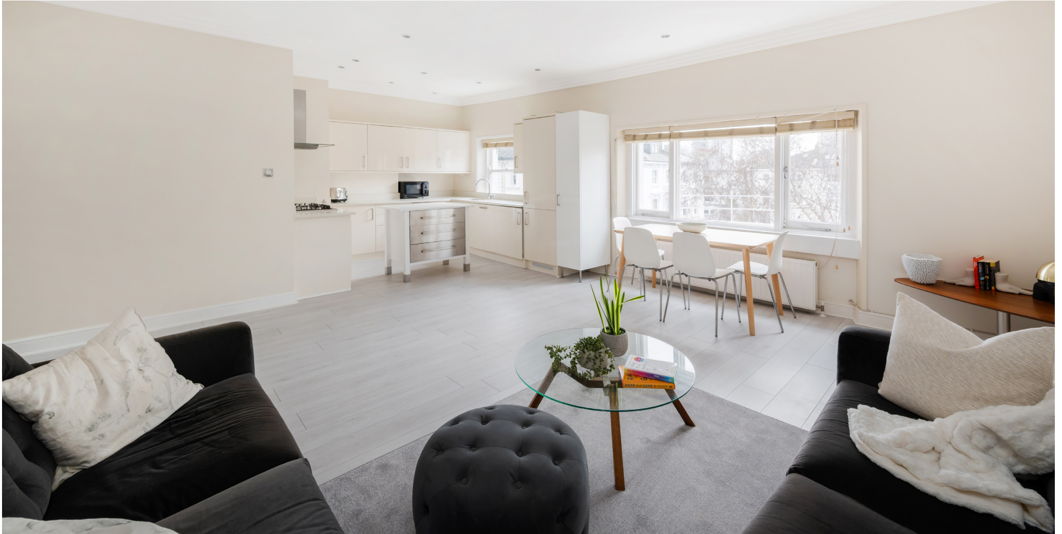
BELSIZE SQUARE NW3