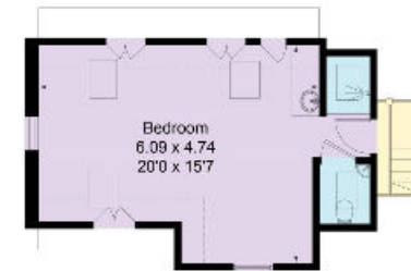
Garage / Annexe - First Floor