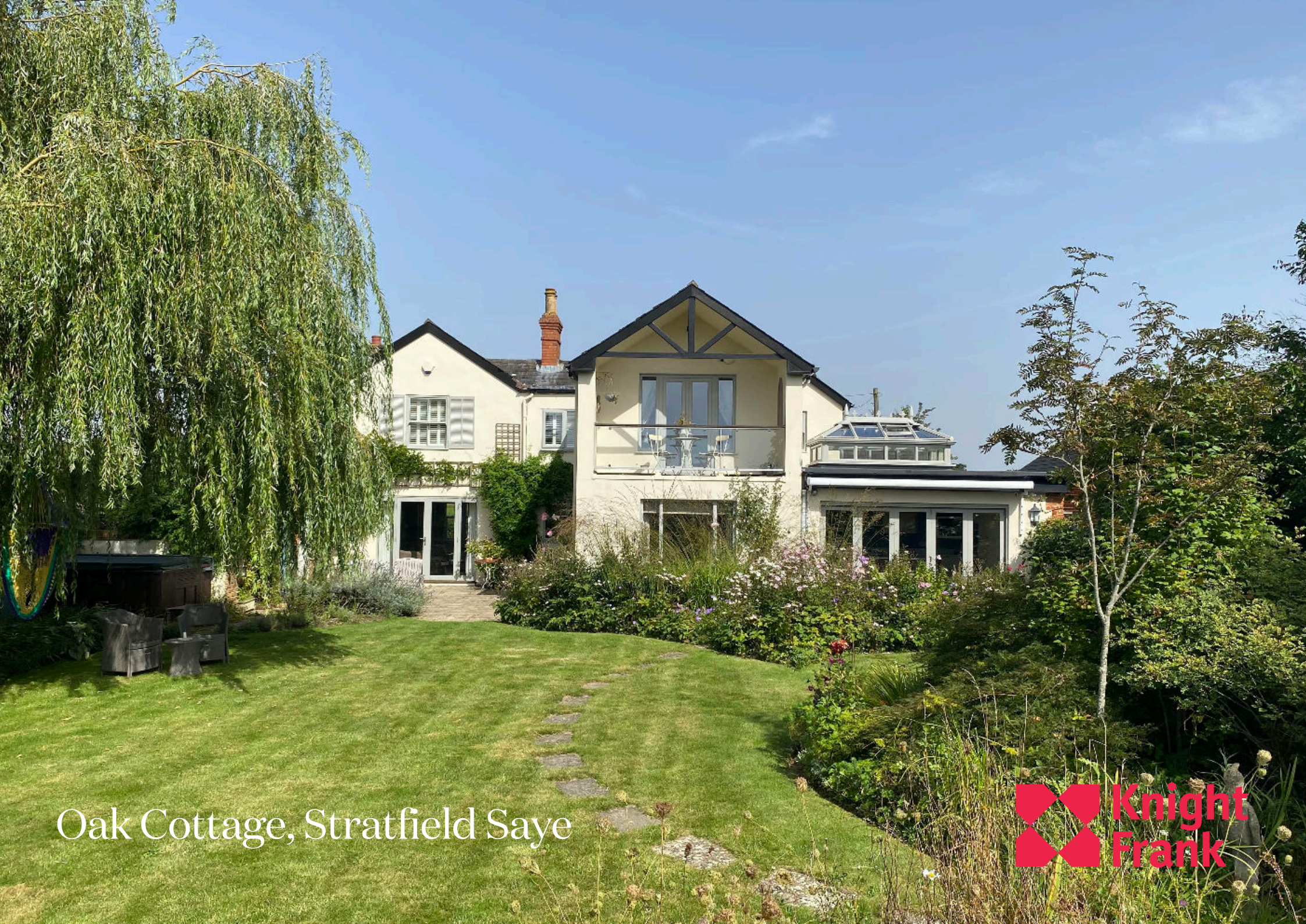
Oak Cottage, Stratfield Saye