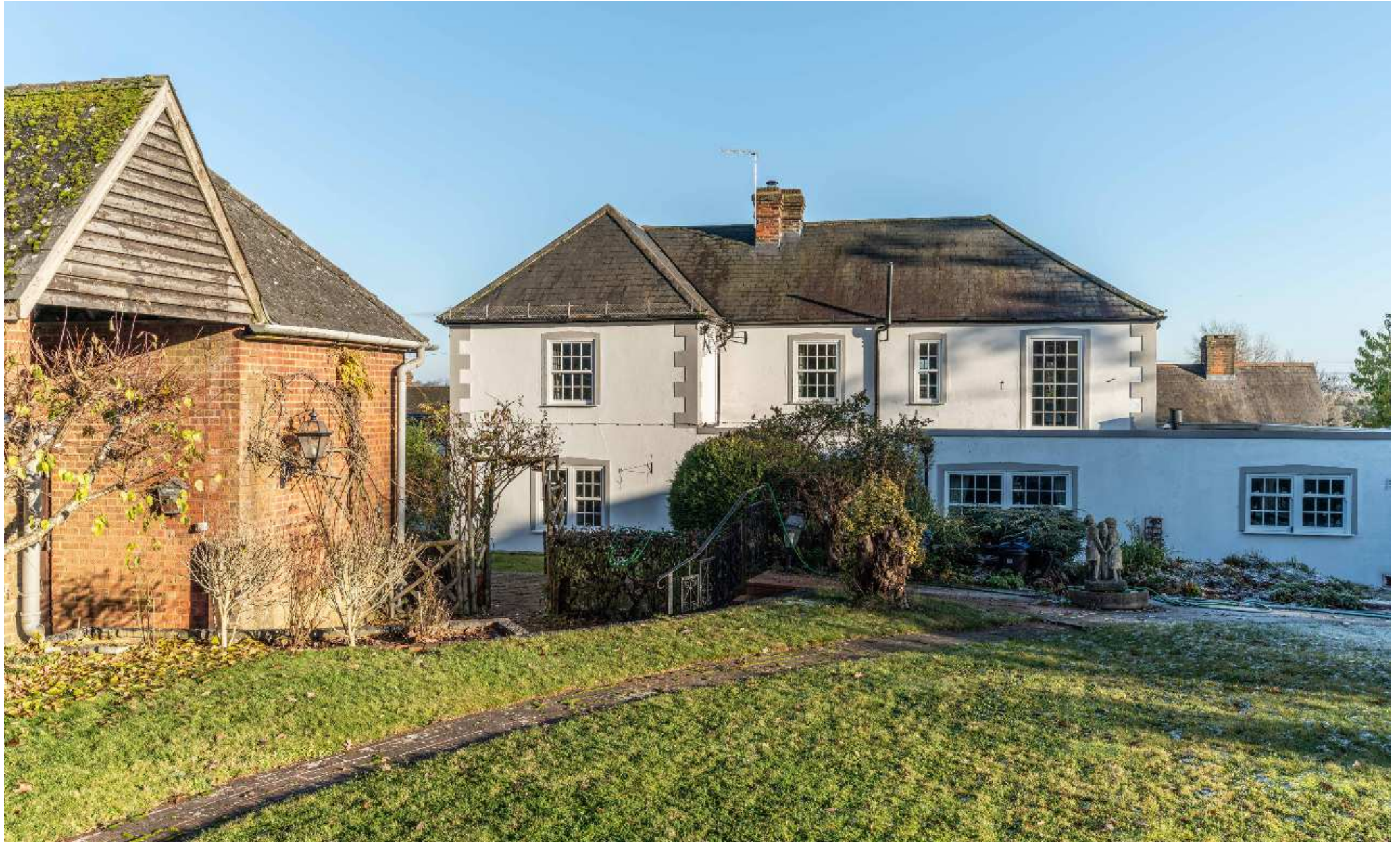
The Stables, Hay Street, Hertfordshire