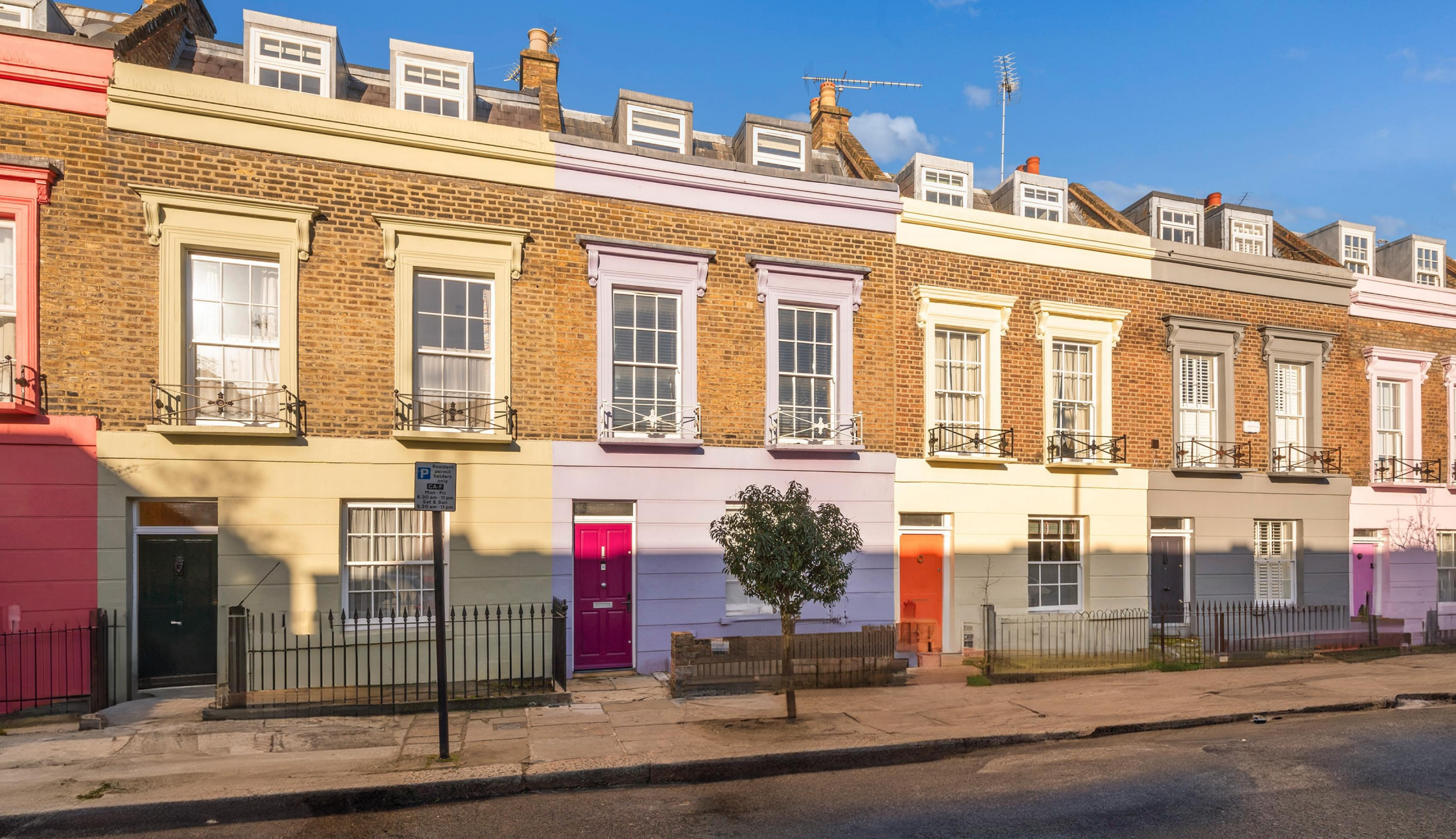
Hartland Road, Camden, London NW1