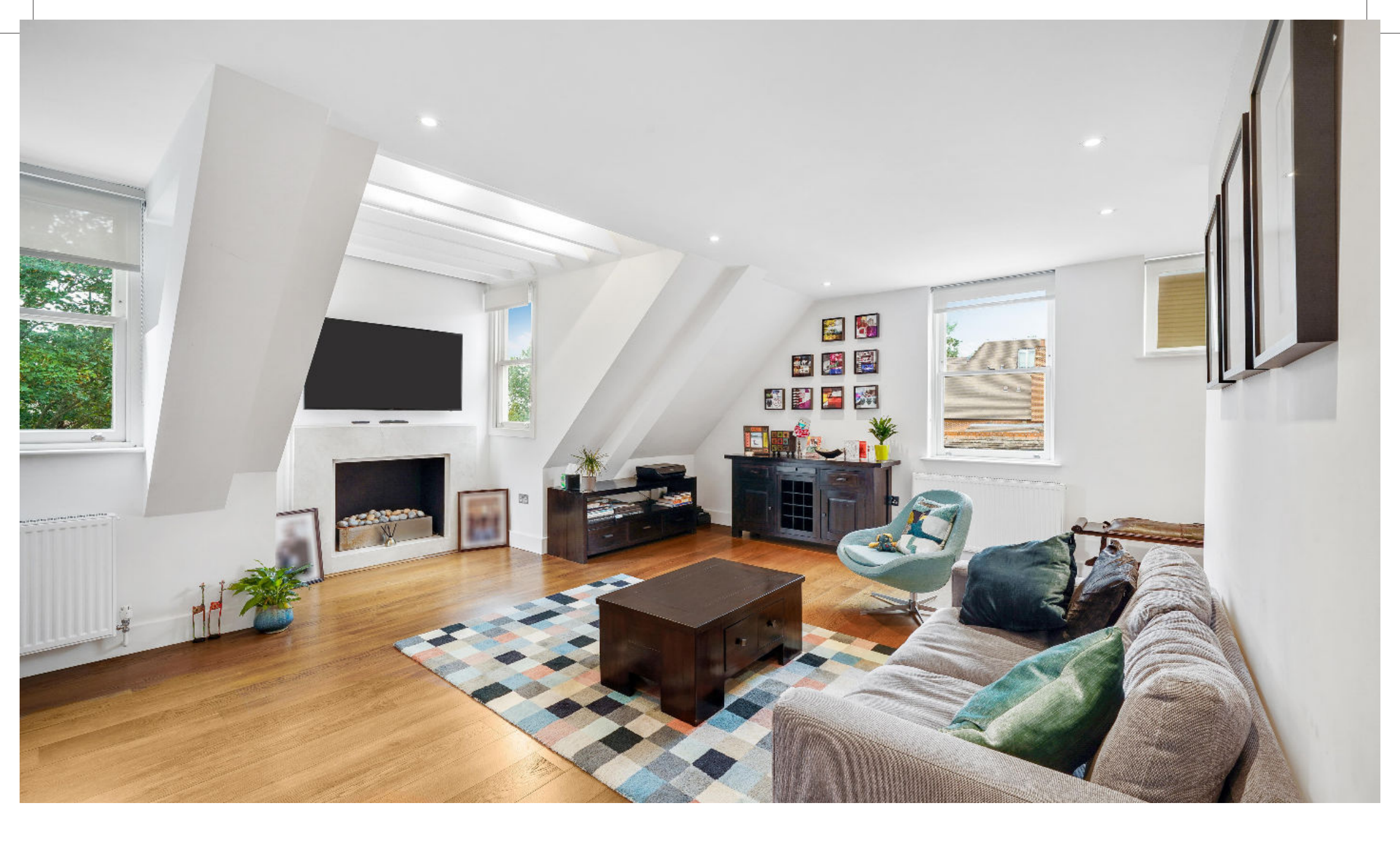
Netherhall Gardens, London NW3