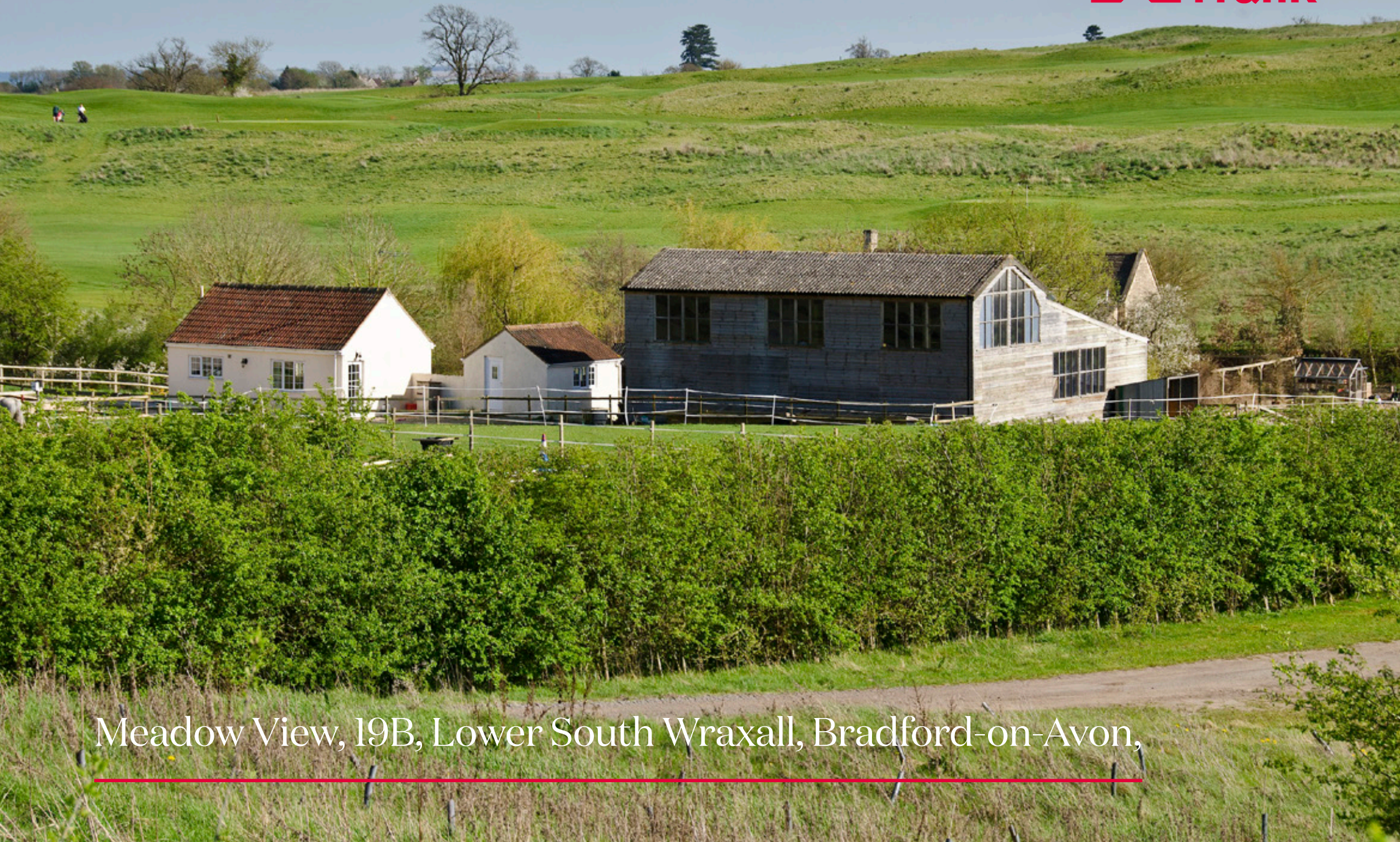
Meadow View, 19B, Lower South Wraxall, Bradford-on-Avon,