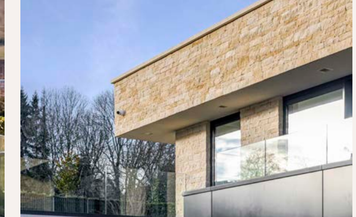
Surrounding the house are landscaped gardens, an expansive driveway and two gates for access to the property. The gardens are mostly laid to lawn with tiered terraces and Cotswold stone walls with black wrought iron railings and hedging for ultimate privacy.